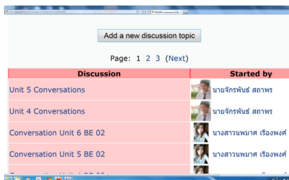
Fig. 2 Discussion web board