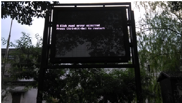
Fig. 11 A media display located in a prominent area frequented by many tourists. The only thing people can see is the error message

Lack of care after installation. Another factor that affects the quality of media displays is the lack of care after they have been installed. Because these displays are normally situated outdoors they are at the mercy of weather and other environmental conditions. It is often necessary to consider the care that these display need after its installation. For example, one obvious defect people see in the Sky Canopy is that some portions are often not working and they complain about it because it destroy the feeling of awe and fascination with it. Another example is the display shown in Fig. 11, which shows an error message and nothing more. The display actually is quite attractive, fits nicely into its surroundings, and is located in a good location. However, the message tells a not-so-positive picture about the aftercare that the creators put into it.