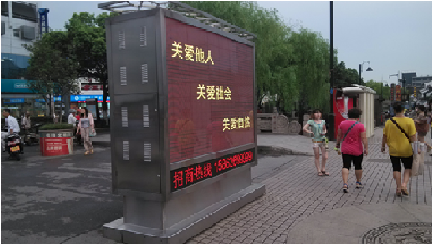
Fig. 9 This display is located in the middle of a popular street in the ancient town. It is not very appreciated by people because they have to walk around it and also because it does not display any information that is useful or interesting to them