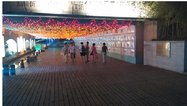
Fig. 10 A wall display made up of small screens which react when there movement. This interactive feature, though very simple, is quite attractive to people, many of whom stop to pay closer attention to its message

Unsuitable or uninteresting content. One of most negative aspects about the displays that people complain deals with the content of the displays. Content is one of most important characteristics of media architecture [15]. This is also expressed by the people with whom we have spoken. They often complain about the message in these displays. People have many things to attend to and would not want to waste their time and energy on something that they find uninteresting. Some of the examples given above prove this point.