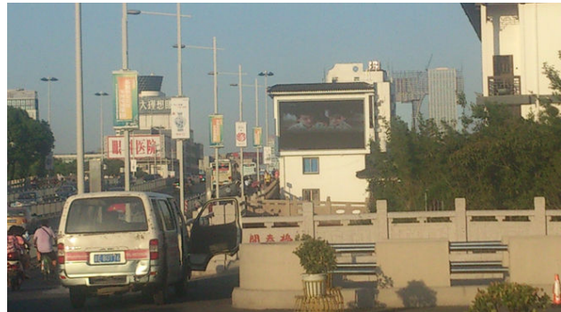
Fig. 7 A large display located at the entrance of the old city of Suzhou. People have mixed feelings about this display which is situated in such a prominent place in the city

high. They also suggested that they would not mind the display as long as it is located at a lower height, because the street is narrow and as such they could not see its content without lifting their neck to an uncomfortable position.