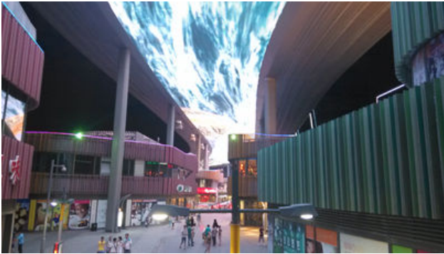
Fig. 3 This picture is taken below the Sky Canopy and shows the display when it is on. Its scale and range of color is meant to impress those walking by. However, people find that its content monotonous

has some limitations. For example, the image definition and quality is not that high, limiting its use. In addition, it is not ergonomic, given that it is directly above people and to view its images people are forced to look up, and this can potentially create stress on people's necks. The biggest limitation is however in its display content. The Canopy only shows content that is very simple and in people's opinion meaningless, with the display being on during a narrow time in the evening, from 8:00 to 8:30 (see Fig. 4 below).