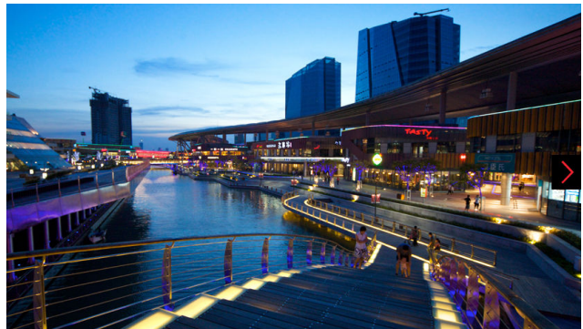
Fig. 3 The Sky Canopy seeing from one side. Its curvature resembles the contour of a river or water canal, like the one it is located next. It is supposed to be a major tourist attraction, with people going to that area for food, shopping, and to simply stroll around. The reality, however, is that it is falling short of expectations

The projection surface is supported by air cushions together with a glass fiber structure that build up a large LED display screen ( http://specialtyfabricsreview.com ). The screen is almost 500 meters long. In terms of attraction, the Canopy is meant to be a symbol of the development of Suzhou. However, the reality is different as it does not seem to play an important role in attracting local people and tourists to the shopping area; there are not that many visitors to the canopy. In terms of technology, the canopy represents a huge developmental step in media displays. It is quite impressive the view it gives, both from above and below. Despite this, it