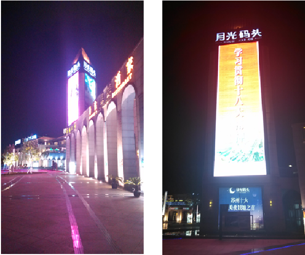
Fig. 6 Two pictures of the Moonlight Harbor Tower. These two pictures are taken from different angles showing how it stands out from its surrounding buildings and at the same time how it is hidden behind others. People often complain about how bright the displays are and how difficult and unpleasant it is to look at