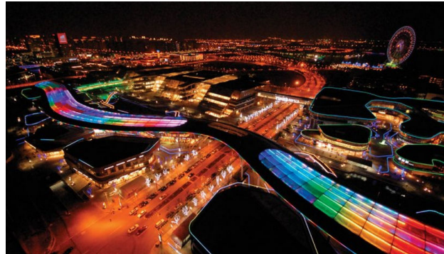
Fig. 2 An aerial view of the Sky Canopy in the evening, showing in full the scale of its impressive structure and the range of colors it can show

The Sky Canopy in the Harmony-Times Square development area (see Figs. 2-4) is a large scale media façade. It represents an unconventional use of media displays, blending the aesthetics and technology into a lighted fabric city landmark. It is one of the largest, if not the largest, media displays of its kind anywhere. It attempts to enhance the shopping space and experience with multimedia projection surfaces that connect the buildings (mostly retail shops) along a water canal.