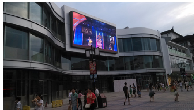
Fig. 8 A large display located on top of a new building next to old ones inside the ancient town. The display is often ignored by people walking by as it is not easy for them to look at and people feel that it does not belong to this area amongst other old, traditional buildings

The next figure (Fig. 9) shows another type of display often found now in the old town. This one in particular is actually located in the main tourist street of the old city and next to a beautiful water canal. The display is mainly used for display some messages from the city and other government institutions. When asked about what their thoughts are about this display, people commented that it is not in a good location because it interrupts the follow of people walking; the street is mainly for people to walk around and no cars are allowed to go in. The second aspect they commented is that it is used to communicate things that they do not find useful or interesting. They have said that there are too many displays already around that area displaying the same messages and are tired of seeing them everywhere. Because of such saturation, they have learned to ignore any content from the displays.