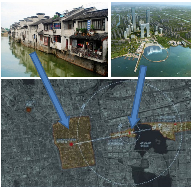
Fig. 1 The two sides of Suzhou: the old and new. The ancient town (represented by the square in the center of the lower picture) of the city of Suzhou is renowned for its beautiful canals, traditional houses, and gardens. The new Suzhou is an example of the fast industrialization of China where many cities are competing with one another to attract investments and skilled people to live there and help to improve their economies and living standards. One main factor of the new zones in Suzhou that is quite attractive is the presence of many lakes

areas. One is old town and the site of its ancient city. Surrounding the old town are the new development zones, one of which is the Suzhou Industrial Park (SIP). SIP is well-connected via nearby airports to cities such as Hong Kong, Seoul, Tokyo, and Taipei, and via high-speed rail to other major cities in China. SIP is a major growth zone, including operations run by nearly one-fifth of the Fortune 500 top global companies. Greater Suzhou is now the fourth largest concentration of economic activity in China in terms of GDP ($195 billion in 2012). The broader Suzhou area encompasses the spirit of both old and new in China, with the historic old town's canals, UNESCO World Heritage Site gardens, and the I.M. Pei-designed Suzhou Museum attracting millions of tourists annually. SIP offers an excellent quality of life with high environmental standards in par with other modern cities within China and outside. The nearby lakes, Jinji Lake and Dushu Lake, provide attractive views, by day and by night, and there are a variety of shopping facilities, international and local restaurants, entertainment hubs and a great nightlife.