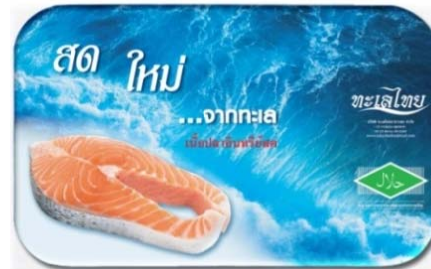
Fig. 4 Value Approach on the Category of Meat

The brand Identities of Thai Halal brands with the value approach. The value of products that affect to consumers perception such as: it is healthy products, accumulate quality of life. It is a product of expertise, manufacturing of research result. Consumers are important. It's sincere, honest and reliable to all. The brand identity created transform to the packaging design should be simply look and using a trustful image as on Fig. 4.