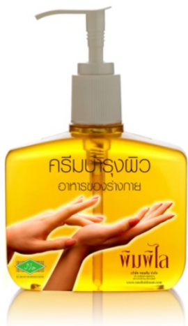
Fig. 15 Benefit Approach on the Category of Hygienic Daily Products

The brand Identities of Thai Halal brands with the value approach. The value of products that affect to consumers perception such as: it is a product of expertise, friendly for all. It is the products of trusty manufacturer. Consumer always comes first as priority service. It is healthy products that accumulate quality of life. Manufacture of research. It is an up to date products. The brand identity created transform to the packaging design should be sincere, enjoyable, merry, flamboyant, charming, dreamy look, using a humoristic story and dazzling image as on Fig. 16.