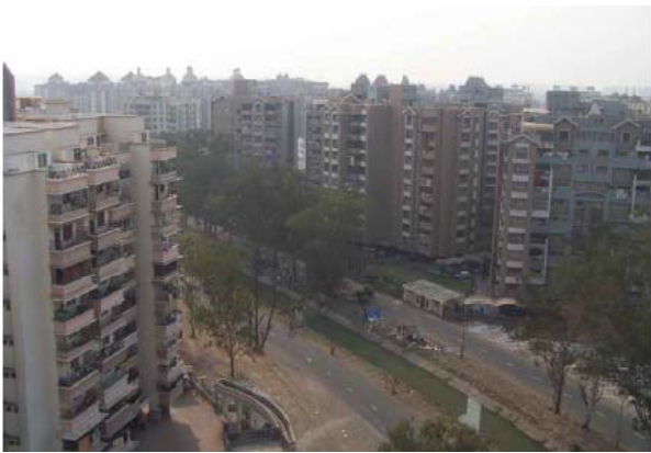
Fig. 1 Proposed Dumas resort-canal road BRTS Corridors of Surat City

However, the population of car in Surat is found less than 75 per 1000 persons. The CO 2 emission for Surat is estimated around 0.035 tons per capita per year. The CO 2 emission is likely to increase as people shift from non- motorized to Two-wheeler and Two-wheeler to Car due to economic growth. Seven corridors are proposed to implement Bus Rapid Transit System in Surat as shown in Fig. 1. The selected corridor for study is Dumas resort-canal road-Sarthana- Jakaatnaka road, which is 23.5 km long.