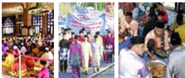
Fig. 16 Main activities of Maulidur Rasul Festival in Malaysia

It is the festival of Prophet Muhammad's Birthday; celebrated by special prayers and sermons in mosques, followed by processions and banquets.