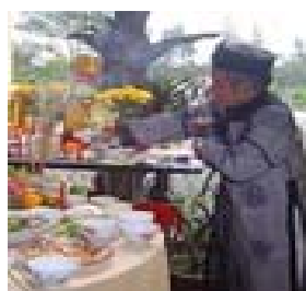
Fig. 32 Vietnamese Buddhist men's costumes for their religious festivals