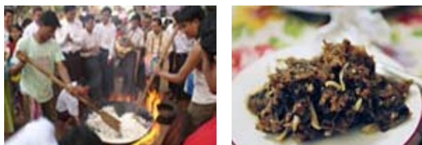
Fig. 20 Main activities of Htamane Festival in Myanmar

It is a celebration for the donation of sticky rice and sesame seeds. There is a competition between teams of men for donation of glutinous rice to the Great Lord Buddha. Lots of people enjoy watching the competition of cooking glutinous rice. After finishing the competition, glutinous rice is distributed as donation to people and followed by the prize giving ceremony for the winners.