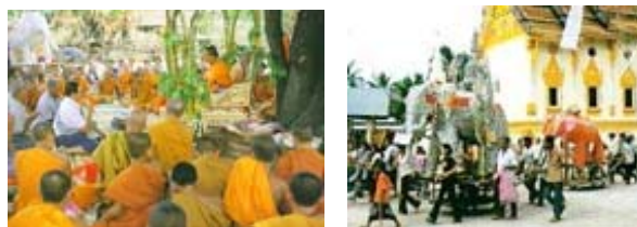
Fig. 11 Main activities of Boun Pha Vet Festival in Laos

It is the celebration of the birth of Prince Vessantara, or Pha Vet, the Buddha's penultimate existence. Lao Buddhist people believe that when people listen to his story, it means they get a lot of merits. In addition, there are play roles ceremony to invite Pha Vet in the forest back to the palace.