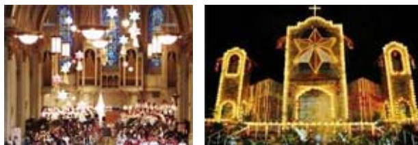
Fig. 22 Main activities of Christmas Festival in Philippines

This festival is a celebration of the birth of Jesus Christ, is the longest and happiest of the Filipino festivals, starts on 16 December and ends in the first Sunday of January. There are the nine-day dawn masses from 16 December to Christmas Eve, known as Simbang Gabi, or Night Mass. On the eve of New Year's Day (31 December), the families make as much noise as they can by lighting firecrackers, beating pans and cans, and blowing horns and whistles up to midnight. The Lantern or Parol is the most popular symbol of Christmas in Philippines.