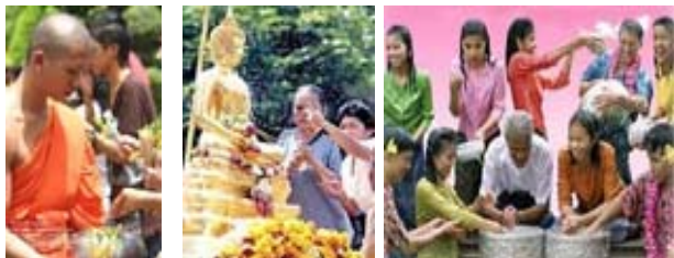
Fig. 25 Main activities of Songkran Festival in Thailand