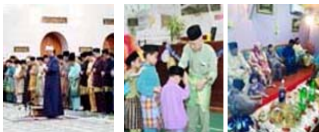
Fig. 4 Main activities of Hari Raya Aidilfitri Festival in Brunei

It is the time for celebration after the end of the fasting month of Ramadhan when prayers are held at every mosque in the country, and families get together to seek forgiveness from the elders and loved ones, and wear their traditional garb while visiting relatives and friends.