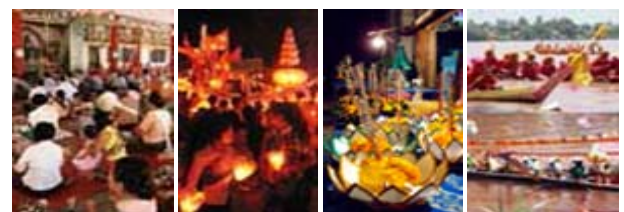
Fig. 10 Main activities of Boun Awk Pansa Festival in Laos

It is celebrated on the day of the end of Buddhist Lent: At the dawn of day, donation and offerings are made at temples around the city. In the evening, candlelight processions are held around the temples and the hundred colorful floats decorated with flower, incense and candle are set adrift down the Mekong River in thanksgiving to the river spirit. The next day, a popular and exciting boat racing competition is held on the Mekong River.