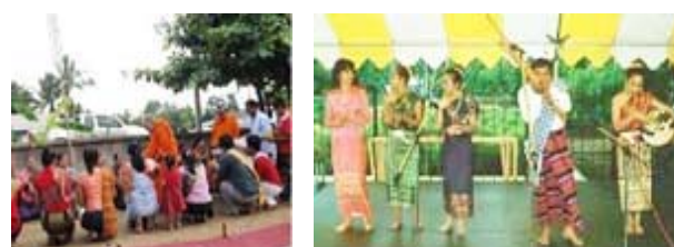
Fig. 13 Main activities of Boun Khao Pradabdin Festival in Laos

It is the celebration devoted to remembering and paying respect to the dead. Lao Buddhist devotees visit local temples to make offerings to the deceased as well as to share merit-making. Music is traditionally performed in the grounds of the temple while people make their donations. This nationwide festival includes boat racing on the Nam Khan River and a trade fair in the center of Luang Prabang, the World Heritage Town.