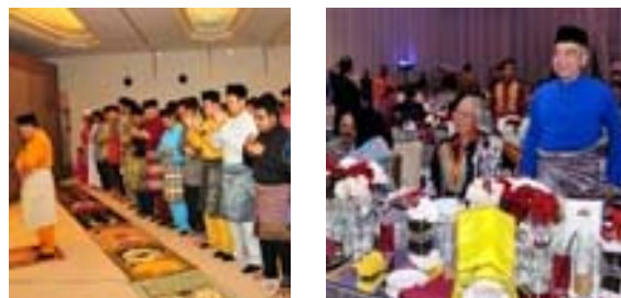
Fig. 17 Main activities of Hari Raya Aidilfitri Festival in Malaysia

It is the celebration after the end of the Ramadhan fasting month. Malaysian Muslims attend special morning prayers in mosques, visit the cemeteries of their loved ones, and take a week off to return to their home towns or village to meet family and friends. Many people host "open house" feasts during Hari Raya, where friends and family gather together to celebrate. Buying (and wearing) new cloth is also a feature of the festival.