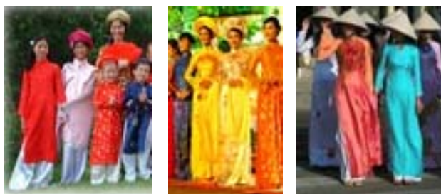
Fig. 37 Vietnamese Buddhist women's costumes for Buddhist festivals