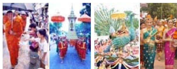
Fig. 12 Main activities of Boun Pi Mai Festival in Laos

This is the celebration of Lao New Year. For this festival of joyous spirit, Lao Buddhist people wear new clothes, Buddha images are washed, temples are repainted, homes were cleaned; thousands of sand stupas are built with their colorful banners and offerings; people gently sprinkle water on one another as a sign of respect; conduct the procession of the sacred Prabang Buddha image, procession of Nang Sangkhan (Miss New Year), and conduct the parade wearing traditional Lao costumes with music and dance.