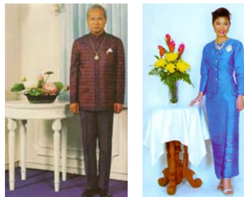
Fig. 38 Most popular costumes for religious festivals in ASEAN countries