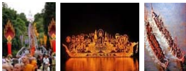
Fig. 28 Main activities of Awk Pansa Festival in Thailand

festival is celebrated by illuminated boat processions in the evening and by boat races during the daytime [12].