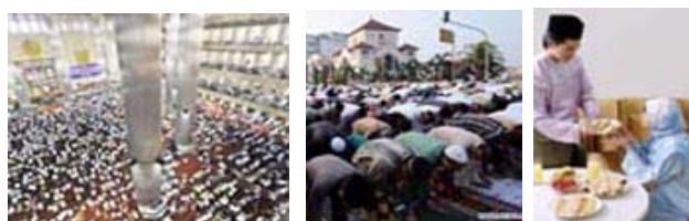
Fig. 9 Main activities of Eid ul-Fitr Festival in Indonesia

It is the celebration after the end of the Ramadhan fasting month. Indonesian Muslims gather to pray in mosques and large open areas around the country, celebrate with the traditional rice cakes, visit family and friends, donate charity, and traditional buy new cloths for celebrating this festival.