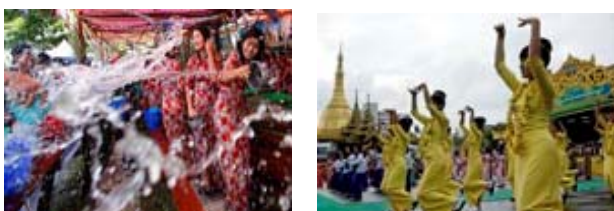
Fig. 21 Main activities of Thingyan Festival in Myanmar

This is the Myanmar New Year Festival and the Water Festival. During the festival, Myanmar people pour water over one another to the melodious tunes of singing and dancing at the decorated pavilions. Pouring water signifies cleansing the body and mind of evils of the past year, performing a lot of meritorious deeds to usher in the New Year such as going to pagodas and monasteries, offering food and alms to monks, paying respect to parents, teachers and the elders, setting free fish and cattle and so on.