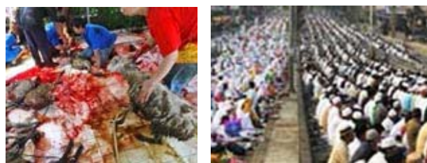
Fig. 7 Main activities of Eid al-Adha Festival in Indonesia

Indonesian Muslims parade and perform the ritual of slaughter of cattle and goats, with the beef and meat distributed to the needy people; and they sit on a street as they attend prayer.