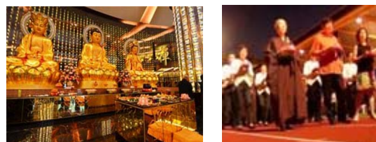
Fig. 24 Main activities of Festival of Vesak in Singapore

Festival of Vesak Day is an annual commemoration of the birth, enlightenment and death of the Buddha; celebrated by chanting of mantras, releasing of caged birds and animals, having vegetarian meals, bathing and illuminating statues of the Lord Buddha, and concluding with a candlelight procession through the streets [10].