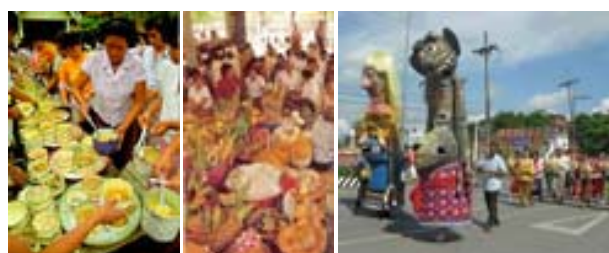
Fig. 26 Main activities of Sart Thai Festival in Thailand

It is the festival of making merit traditions and the honoring ghosts & ancestors of Thai Buddhists. This traditional festival is now celebrated mostly in Thailand's southern provinces, especially in Nakhon Si Thammarat, and other parts of Thailand. It has many features of animism, attributing souls or spirits to animals, plants, and other entities [12].