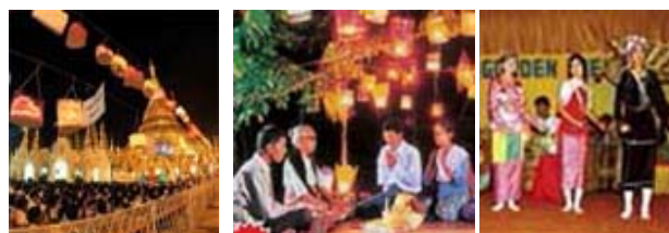
Fig. 18 Main activities of Festival of Lights in Myanmar

This is celebrated at the end of Buddhist Lent. This festival commemorates the time when the Buddha returned to the earth after preaching in the abode of celestials during the three months of Lent. He descended at night and devotees greeted him with lamps and lanterns. So people decorate their houses with candles and colored lanterns. Pagodas are crowded with people in doing of meritorious deeds so it is not only a time of joy but also of thanksgiving and paying homage to parents, elders. There are concerts and theaters in every city.