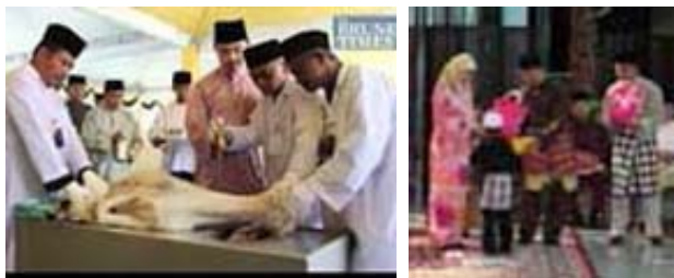
Fig. 2 Main activities of Hari Raya Aidiladha Festival in Brunei

Sacrifices of goats and cows are practiced to commemorate the Islamic historical event of Prophet Ibrahim; then its meat is distributed among relatives, friends and the less fortunates.