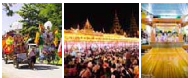
Fig. 19 Main activities of Tazaungmon Full Moon Festival in Myanmar

This festival is a celebration for the season of the offering robes and other requisites needed by monks after the end of Buddhist Lent. Cash offerings for monasteries are also collected and displayed on wooden frames built in the shape of a tree. There is the special offering of Mathothigan, or timely woven robes, a robe that is woven in one single day, held on the night of the eve throughout to the full moon day. There are weaving competition to complete the robes, which are offered to images of Buddha.