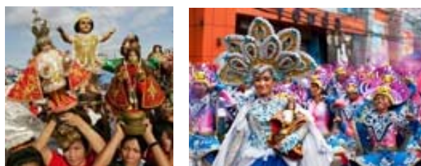
Fig. 23 Main activities of Feast of the Santo Niño in Philippines

It is a celebration for the Holy Child Jesus, a miracle worker, known as El Santo Niño de Atocha, celebrated by colorful parades, fluvial processions and street dancing.