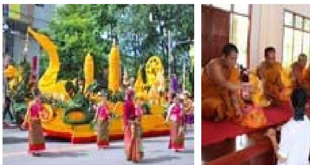
Fig. 27 Main activities of Khao Pansa Festival in Thailand

It is the period of 3 months of Buddhist Lent. During this period, coinciding with the rainy season, Buddhist monks and novices remain closeted in their particular Buddhist temples, and discouraged from spending nights elsewhere. In Khao Pansa Festival, there are 2 main important things which Thai Buddhist presented to monks: the large candles are carried by beautiful processions, and garments worn by monks, especially the bathing robes [12].