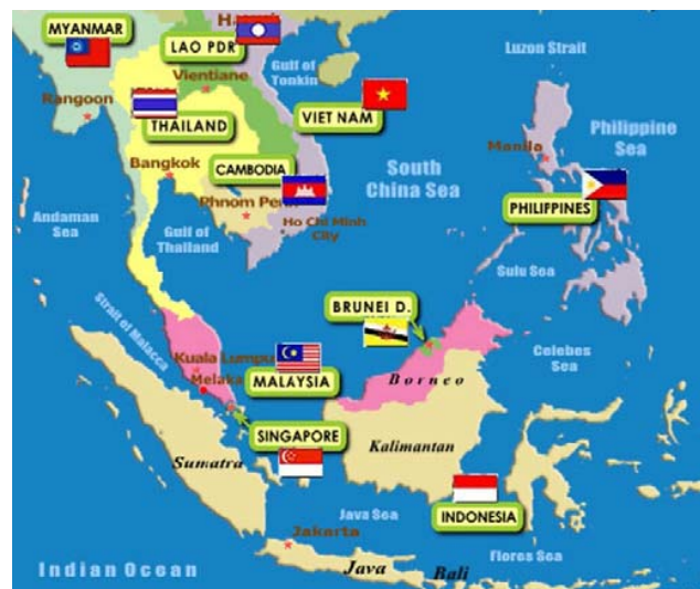
Fig. 1 Map of ASEAN countries

A. The Major Religious Festivals of Merit Making and Joyful Celebrations (Nationwide) in Each Country of ASEAN Countries