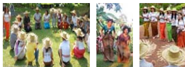
Fig. 6 Main activities of Khmer New Year Festival in Cambodia

Khmer people visit local temples to make offerings to monks, engage in traditional Khmer games and merrily dance Khmer forms in the open.