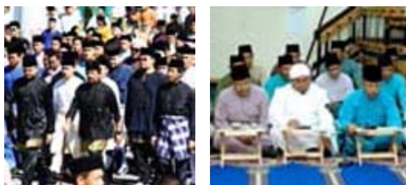
Fig. 3 Main activities of Mauludin Nabi Festival in Brunei

Prophet Muhammad's Birthday celebration is celebrated by conducting processions on foot through the main streets of the city, religious functions, religious lectures and other activities.