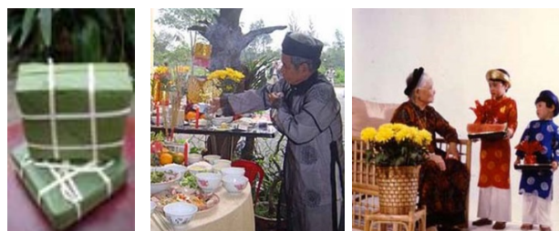
Fig. 29 Main activities of Tet Nguyen Dan Festival in Vietnam

Tet Nguyen Dan Festival is the celebration of Vietnamese New Year. In this festival, Vietnamese Buddhists cook special foods, clean the house, worship the spirit of dead ancestors, wish New Year's greetings, and give lucky money to children [13].