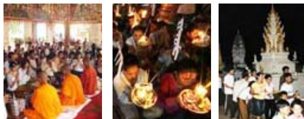
Fig. 5 Main activities of Pchum Ben Festival in Cambodia

Khmer people bring food to the temple for the monks and to feed hungry ghosts who could be their late ancestors, relatives or friends. Pagodas are usually crowded with people taking their turn to make offerings and to beg the monks to pray for their late ancestors and loved ones; many remain behind at the temple to listen to Buddhist sermons.