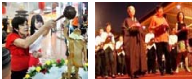
Fig. 36 Singapore Buddhist women's costumes for their religious festivals