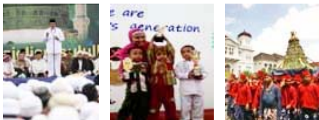
Fig. 8 Main activities of Maulid Nabi Festival in Indonesia

cities, such as Yogyakarta and Surakarta, believers celebrate the Maulid by conducting parades or carnivals, reciting special prayers and singing holy songs.