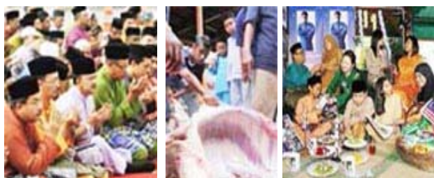
Fig. 15 Main activities of Hari Raya Aidil Adha Festival in Malaysia

Malaysian Muslims celebrate the festival with prayers and the sacrifice of cattle in local mosque, and their meat are distributed to all. It is also the festival of family reunion.