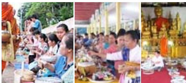
Fig. 14 Main activities of Boun Khao Salak Festival in Lao