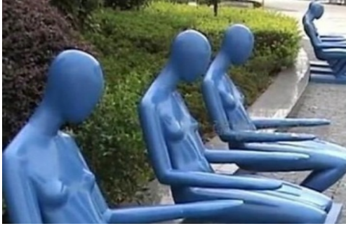
Fig. 12 Sculptures used as seats