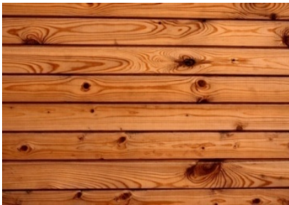
Fig. 10 (b) The wooden texture

In the historical area, we should try to reflect the historical context when selecting materials. In the modern area, appropriate colors should be used to show the roads' themes and functions. For example, the road landscape in financial districts should give priority to modern materials, including metal, concrete, glass, luminescent fiber and so on, in order to reflect some industrial characteristics, like preciseness, and quick.