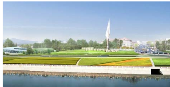
Fig. 17 The landscape used as a signal and landmark