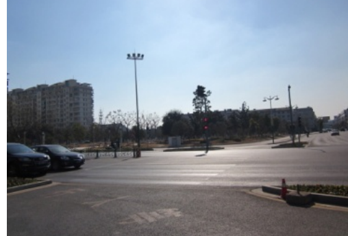
Fig. 5 (a) Urban road landscape's lack characteristics

Landscape elements, such as roadside buildings, vegetations, furniture and facilities, are lack of consideration in a unified way when being designed, and different landscape elements are lack of coordination and independent with each other, then making the overall style of the road vague and the road landscape messy and chaotic, eventually making the image of city road landscape obscure (Fig. 5).