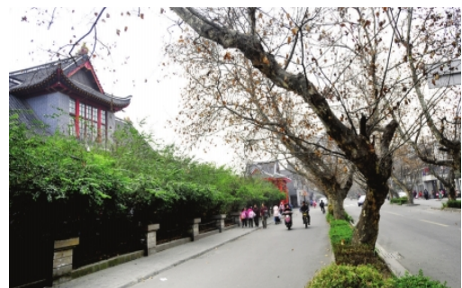
Fig. 14 The rich flavor of the humanities on the University Avenue in Chengdu

The humanities connotation of urban road landscape can be regional culture and traditional customs, also it can be the functional properties of the road itself, which can be embodied and conveyed by morphological shapes [9]. For instance, roads in the university town can use the morphological shape of road landscape to express the humanistic connotation, which gives priority to imparting knowledge and educating people (Fig. 14), whereas roads in the financial district should show their preciseness, rationality and efficiency and many other industry characteristics. In terms of roads in the dwelling district, they should reflect the warmth and harmony of home. Road landscape facilities (such as buildings, sculptures, signboards, leisure chairs, etc) are the carrier of the philosophy and humanities of roads, so they should be designed systematically by combining with the philosophy and humanities of roads, in order to construct identifiable and imaginable road landscape.