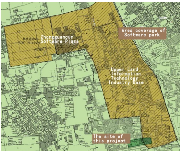
Fig. 15 The analysis of the location

The site of this project is made up an area of 4.35 hectares. It is important and has obvious symbol significance. This is because its southern side adjoins River Qing and the North 5th Ring Road, which is a significant road in Beijing and has a high traffic volume. Also, the Information Road, which goes through this site, leading to Upper Land Information Technology Industry Base and Zhongguancun Software Plaza (Fig. 15). Therefore, this project aims to shape a good road landscape node and a iconic door along the North 5th Ring Road and the Information Road and to promote the identifiability and imaginability of Upper Land Information Technology Industry Base and Zhongguancun Software Plaza.