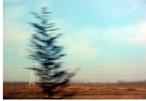
Fig. 7 Close-up views passes in an instant watched from a fast moving car

Regarding roads for living, it is more complicated, because they are used for diverse purposes, including motorized travel, non-motor vehicle travel, walking, and so on. The driving speed on such roads are much slower and it has less impact on people's vision, thus the landscape of those roads can be designed under the principle of the low speed or static view. People's feelings of the landscape are comparatively more exquisite when walking, and the ways they appreciate the landscape is not single perspective, but diverse perspectives. As a result, the landscape design of roads for living should pay attention not only to the design of shapes and profiles, but also to the design of details, in order to bring exquisite landscape experience and improve the imaginability of road landscape[3].