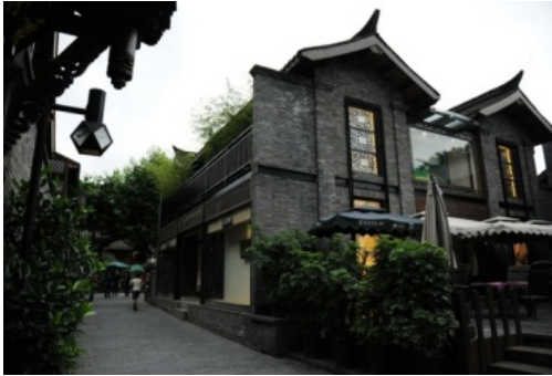
Fig. 9 The Silent color in the historic district in Chengdu

should consider some warm and bright colors in order to bring people a sense of warm through vision. The design of urban road landscape in historically protected area should select some colors which are in coordination with the environment (Fig. 9).