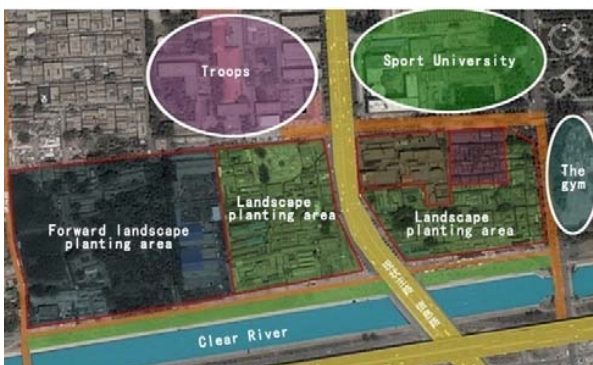
Fig. 18 The current conditions and surrounding landscape elements