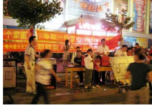
Fig. 13 (b) The modern raise donations activity on roads

Under the premise of ensuring the well administration of roads, traditional thematic activities should be continued and developed, and some new thematic activities in line with modern life should be guided and promoted [8]. By doing so, a stable sense of place will be formed, and the cultural connotation and value of road landscape will be promoted. Also, people's sense of identity and belonging will be enhanced, and then the imaginability of road landscape will be improved.