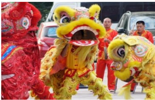
Fig. 13 (a) The traditional lion dancing activity on roads

Urban road landscape not only includes material landscape, but also includes non-material landscape, like thematic activities. Roads are places for people's public activities, and they have developed many local customs and culture in the long history [7]. For example, in the past people enjoyed holding temple fairs, street markets, lion dancing and many other traditional activities, whereas people prefer to hold some performances now, advertising, whip-round and many other activities according to current affairs (Fig. 13).