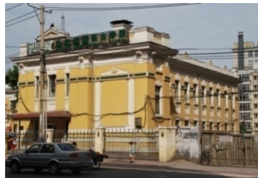
Fig. 8 The main color in Harbin is yellow

The Color tends to be the most eye-catching element, so it is the most recognizable image feature. The appropriate design of the colors of the road landscape can increase the visual impact that road landscape has on people, thereby shaping image of road landscape with a bright and distinct character (Fig. 8).