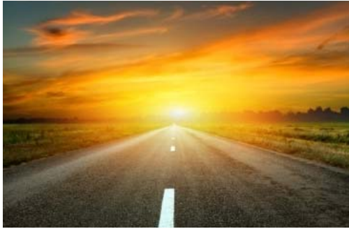
Fig. 2 (b) Landscape elements—climate and weather