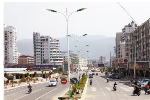
Fig. 5 (b) Disordered and messy urban road landscape