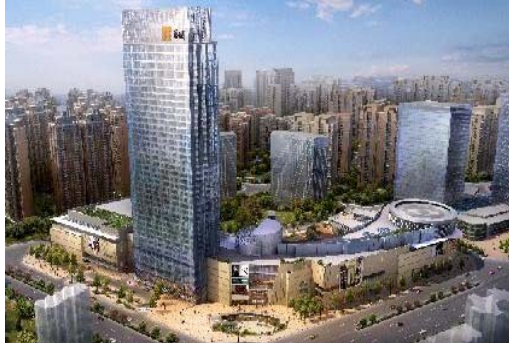
Fig. 6 The design of the underlying buildings is more exquisite than the upper ones