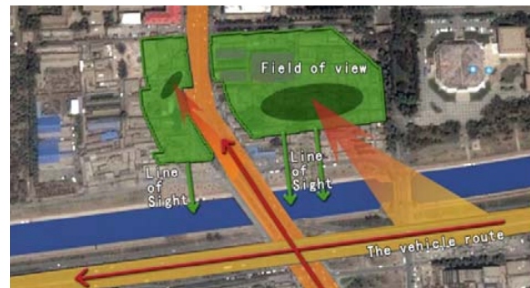
Fig. 16 The analysis of the viewing sights