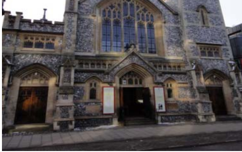
Fig. 2 (a) Landscape elements—roadside buildings