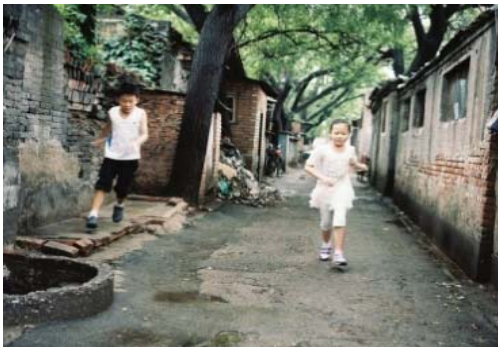
Fig. 4 The disappearing hutong in Beijing

The existing roads always show no respect to the original urban landscape, and the new landscape elements are always incompatible with the former landscape elements. Therefore, the original urban road landscape features and historical context are destroyed, people's memory and identity to the environment are ruined, and the imaginability of road landscape is reduced (Fig. 4).