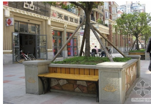
Fig. 11 The combination of seats and tree pools

If an entity can integrate a variety of functional requirements, it will stimulate people's creativity, imagination and cognitive activity, resulting in a joyful aesthetic process. Combining sociability with comfortableness when designing road landscape can promote people's communication in the space along roads. The combination of functional symbol can improve the taste of the road landscape, such as tree pool benches or other street furniture (Fig. 11).