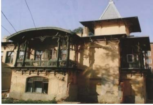
Fig. 3 An isolated historical building on the back of the West Street in Harbin