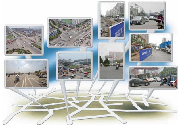
Fig. 1 The chaos in the urban road landscape

integrate the various elements of the urban road landscape and facilitate people to perceive cities on roads.