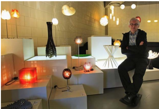
Fig. 4 RP model of an electrical appliances

The house holding electrical appliances are widely manufactured in the RP techniques. These RP techniques are very useful for manufacturing the special contours in an electrical item. Fig. 4 shows the RP models of electrical appliances.