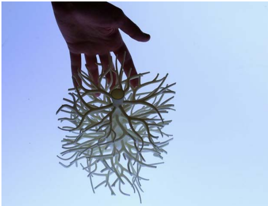
Fig. 8 (b) RP model of special objects (Tree stems)