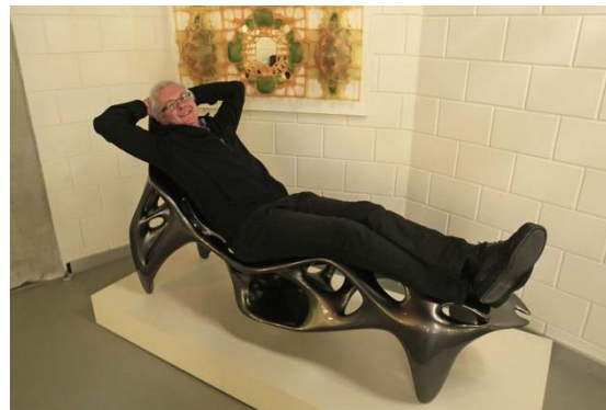
Fig. 6 RP model of furniture