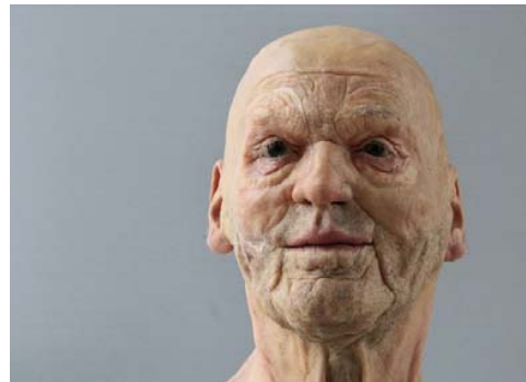
Fig. 2 Damaged facial skull replaced by RP model