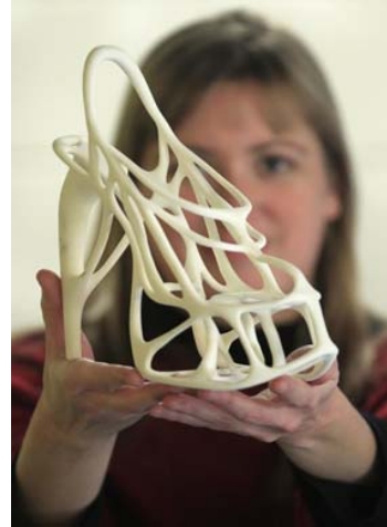
Fig. 5 RP model of foot-ware

The furniture is designed and manufacturing with a aid of RP techniques. This model has low weight and no temporary and permanent joints. It is made up of a single piece without any joints with different profiles. Fig. 6 shows the furniture model developed in the RP technique.