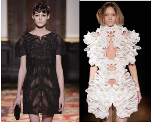
Fig. 3 RP model of dresses with special contours