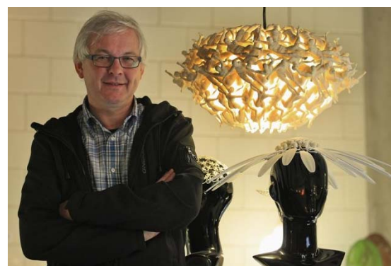
Fig. 7 RP models of an architectural interior design

An RP technique plays an important role in architectural interior design like stature, wall mountings and toys. The RP model of interior decoration has good surface finishing and aesthetics compared with convention models. Fig. 7 shows RP models of an architectural interior design.