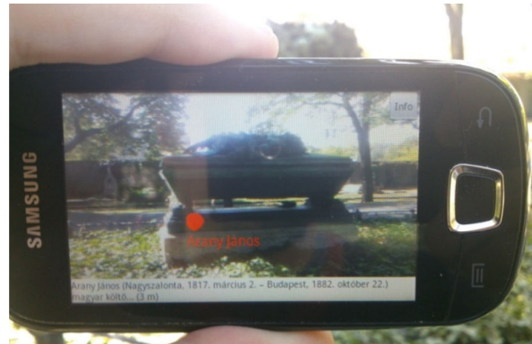
Fig. 4 Augmented Reality-based navigation

The other visualization solution is based on the Augmented Reality. Currently, several Augmented Reality engine already available, but we decided to implement an own module. The reason was that the existing Augmented Reality engines are typically complex, resource-intensive as well as difficult to use. Accordingly, we have implemented an own Augmented Reality module, which based on the mathematical model described in [21]. This module is easy to use and with the help of it is simple to implement location-based Augmented Reality applications. Once the user navigated the nearest junction of the selected tomb by using the map view, the Augmented Reality-based navigation allows him to get to the final destination. The user could see the distance between the current position and the selected tomb via the camera of smartphone. The right direction towards its final destination is displayed as well. Fig. 4 illustrates an example of the operation of this module.