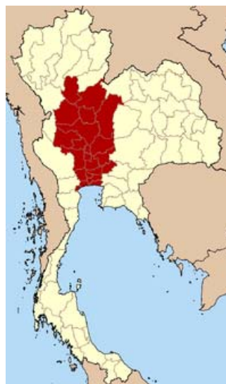
Fig. 1 Map of Central region in Thailand

The rice straw power plant capacity could evaluate from the current quantity of surplus rice straw. The operating conditions of power plant capacity of 9.5 MW were used as assumptions for this evaluation. Plant efficiency was around 33%, which could be operated to 330 days per year. The plants thus required fuel biomass supply of 67,620 ton/year (LHV of 14 MJ/kg and moisture content of 12% w.b.).