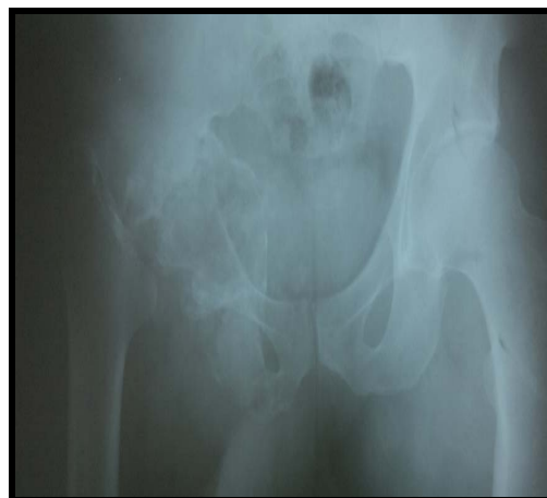
Fig. 3 Case No. 2: Long Bone Involvement (Left Humerus)