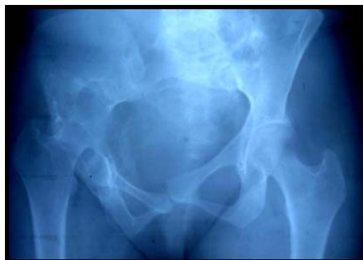
Fig. 5 Case No. 4: Hip and Pelvis Involvement