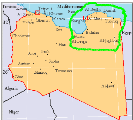
Fig. 1 Map of Libya Showing Eastern Libya Illustrated by Green Circle