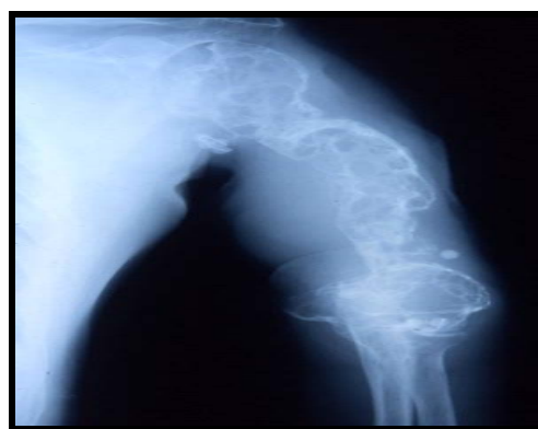
Fig. 4 Case No. 3: Hip and Pelvis Involvement