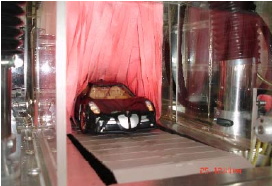
Fig. 3 Washing