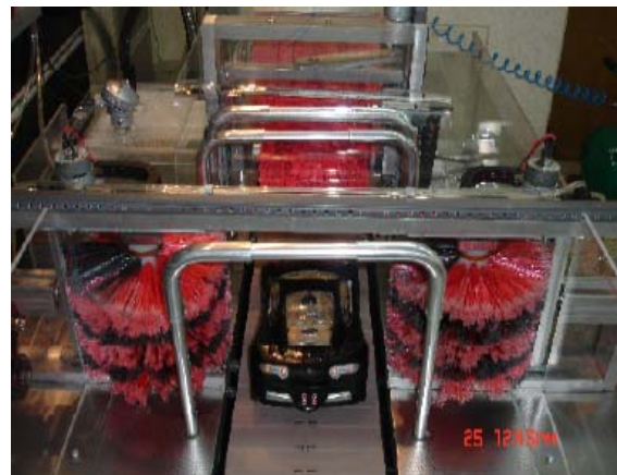
Fig. 2 Sampling of vehicle dimensions

The geometry sampling of vehicle by metering sensors is carried out and data is sent to I/O function unit with two decimal places (Fig. 2). PLC uses these dates to adjust functional program of the device.