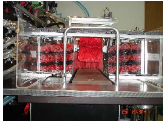
Fig. 1 Stepper motor control

The function of motor can be controlled by PLC according to the number and frequency of pulses and these factors changes. Of course this requires the implementation of specific programs, but for better performance, a special module for stepper motor control in three Forward, Backward and off is designed which is programmable on the base of motor type and can be changed and adjusted easily.