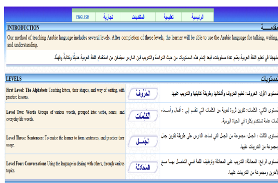
Fig. 1 Teaching Arabic to Non-Arabic Speakers

The next site for learning Arabic language had been chosen to expand knowledge.