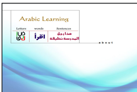
Fig. 4 System GUI

It can be simplified by using the interactive environments which would be closer to a wider understanding of the Arabic language, a main menu, Fig. 4, shows that learners can choose the topic that they are interested in and enter all materials which are included.