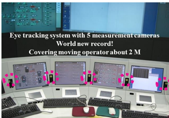
Fig. 2 Five-camera Eye Tracking System (ETS) installed in HUEPSS

representing the plant state (e.g., process parameters and alarms) and control activities performed by operators. Process parameters are observed and evaluated to see how well the plant system is operated. Design faults or shortcomings may require unnecessary work or an inappropriate manner of operation, even though plant performance is maintained within acceptable ranges. This problem is solved by analyzing plant performance (or process parameters) with operator activities. Inappropriate or unnecessary activities performed by operators are compared with logging data representing the plant state if operator activity is time-tagged. This analysis provides diagnostic information on operator activities. For example, if operators should navigate the workstation or move around in a scrambled way in order to operate the plant system within acceptable ranges, the HMI design of the ACR is considered inappropriate. As a result, some revisions are followed, even though the plant performance is maintained within acceptable ranges. An eye tracking system equipped with five measurement cameras records eye movement of a moving operator on a wheeled chair, as shown in Fig. 2 and provides data for evaluation of situation awareness, cognitive workload and personnel task. Eye-tracking measures for evaluations of situation awareness and cognitive workload are connected to personnel task performance with time-tagged information.