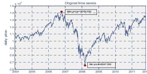
Fig. 1 Time series plot of DJIA30

Fig. 1 shows the stock market index behavior over the time and we can see the data are not stationary and it appear that (DJIA30) rise to the peak in the end of 2007, but steep down to lowest point in the beginning of 2009.