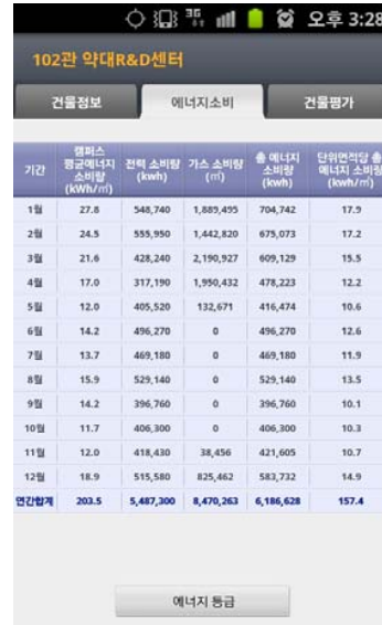
Fig. 5 Monthly energy consumption