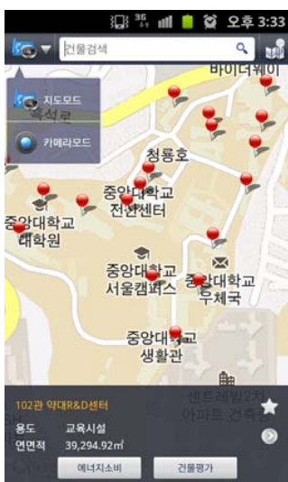
Fig. 3 Information by map