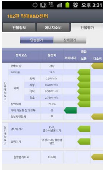
Fig. 7 Energy efficiency potential Assessment (Simplified mode)