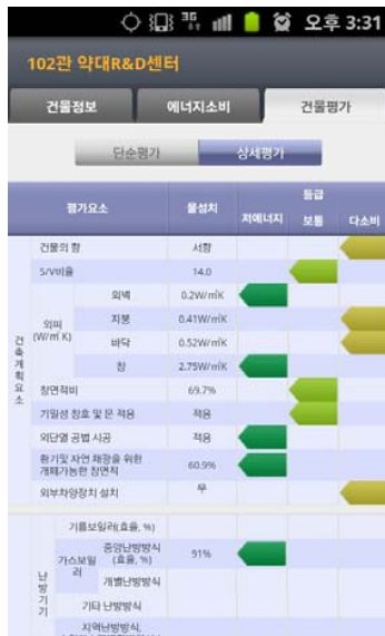
Fig. 8 Energy efficiency potential Assessment (Detail mode)