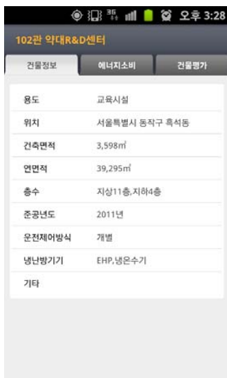
Fig. 4 Building information