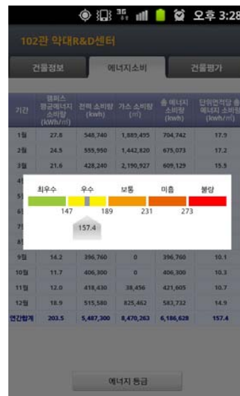
Fig. 6 Energy performance level by energy consumption