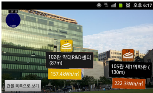
Fig. 2 Calling information by camera

kWh/m 2 , showing a large deviation depending on the use status. Some of the multi-purpose buildings showed particularly high amounts of energy consumption because of the power demand for lectures, administrative works, and experimental devices.