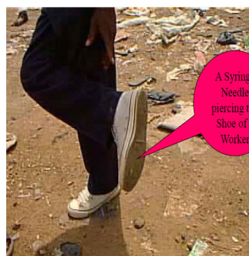
Fig. 3 Risk at a Dump Site in KwaraState Nigeria [20]