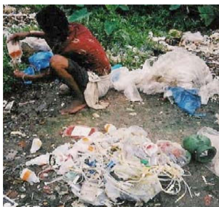
Fig. 5 Medical Waste Scavenging in Bangladesh [15]

In developing countries, additional hazards occur from scavenging at waste disposal sites and the manual sorting of hazardous waste from health-care establishments.