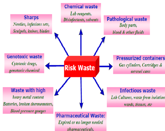
Fig. 2 Categories of hazardous medical waste [15]

According to [16], [17], and [15] health-care waste is classified as Sharp waste (e.g., hypodermic needles, scalpels etc.), Chemical waste (e.g., reagents, solvent etc.), Pathological waste (e.g., human tissues, body parts, fetus, etc.), Infectious waste (e.g., blood and body fluids etc.), Pressurized containers (e.g., gas cylinders, aerosol etc.), Pharmaceutical waste (e.g. out-dated medications, etc.), Genotoxic waste (e.g., cytotoxic drugs and genotoxic chemical) and Waste with high heavy metal content (e.g., batteries, thermometers etc.) (See Fig. 2):