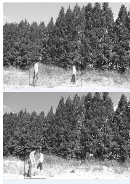
Fig. 3 Simulation result images

To verify proposed algorithm, 100 frames were simulated, and 95 of them were correct detection and 5 of them had false detection by performing 95% of correct detection rate. The some simulated results are shown in Fig. 3. Therefore, proposed algorithm can be used as an effective moving object detection algorithm since it has a high detection rate.