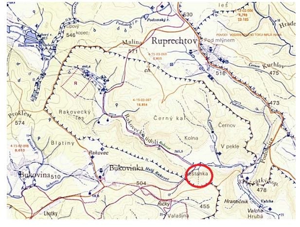
Fig. 2 Hydrological Map of the Area

Note: Red circle shows the site of drilled well