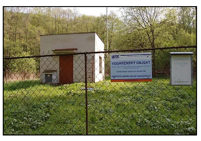
Fig. 3 Ježkovice RV12 drilled well and its surroundings

Note: Red circle shows the site of drilled well