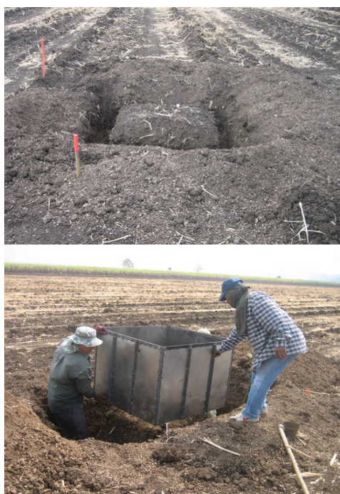
Fig. 2 Conducted trenching experiment for monitoring soil respiration in sugarcane crop

In this study, root respiration was measured by a direct measurement method during the growing period between February and December 2012. Trenched plots, areas without roots, were established to assess sugarcane root respiration and its contribution to total soil respiration (Fig. 2).