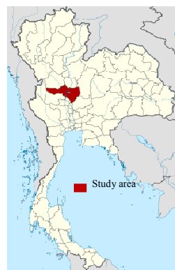
Fig. 1 Study area located in Nakhon Sawan province (Modified from Wikipedia [8])

The experimental site covering an area of 535m 2 is located in a permanent sugarcane field at Nakhon Sawan province situated in the lower northern region of Thailand (Fig. 1).