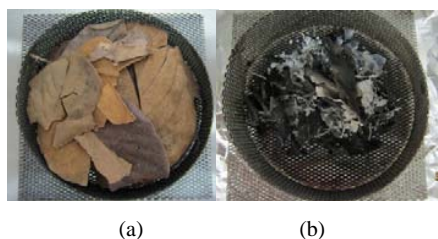
Fig. 3 Leaf litter before (a) and after burning (b)