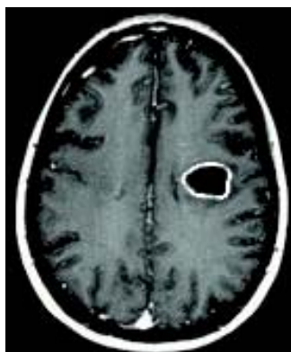
Fig. 1 (a) Magnetic Resonance (MR) image of brain

Image segmentation is defined as the partitioning of an image into non-overlapping regions which are homogeneous with respect to some characteristic such as intensity [9], that not easily happen in the medical image because most of medical image have a tissue (overlapping region) but the fuzzy kohonen neural network have ability to segmentation the MRI brain. The figures show the results: