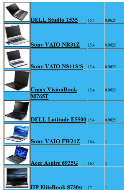
Fig. 3 Calculation of fuzzy values

The application is a storage system which informs the customer about the number of goods at five different stores (off-site storage, Storage: Prague, Brno, Olomouc and Ostrava), and last but not least, there is a possibility of discussion about any laptop between customers and staff. Figure 4 is a sample catalogue of laptops. For more information, see the thesis [1].