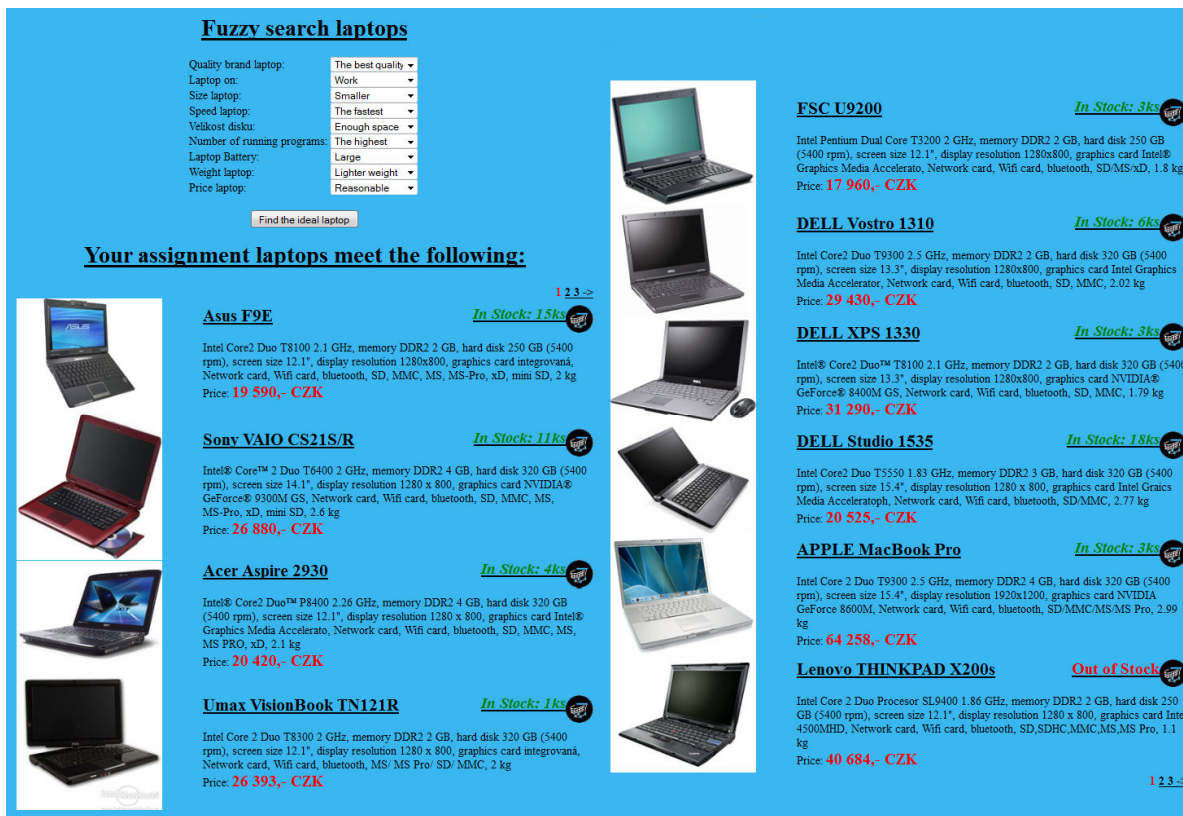
Fig. 5 Search query results and a search