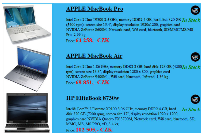
Fig. 6 Sample survey catalogue laptops