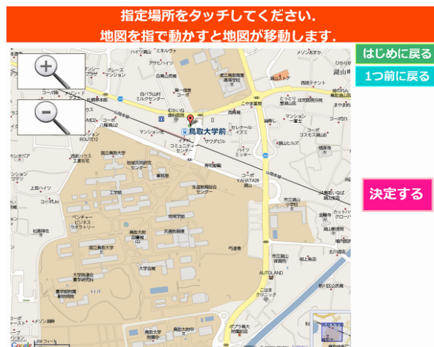
Fig. 8. Input position by "Google Maps"

3) Display of path planning result : When it finishes inputting all conditions necessary for the path planning, "Intelligent-Bus-Stop" send the condition of inputting it to the server of the "Bus-Net" as set of CGI parameters. The path planning is done with the server, and the result is returned as XML. The "Intelligent-Bus-Stop" picks up necessary information from XML. And it displays path planning result easy to see. Fig.9 shows it example. Moreover it displays a QR cord expressing URL of "Bus-Net" which displays the result that