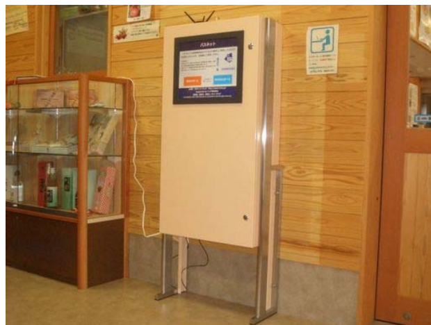
Fig. 6. Intelligent-Bus-Stop

"Intelligent-Bus-Stop" uses touch panel of 19 inches as an I/O device. Fig.6 shows the face of "Intelligent-Bus-Stop". System's OS uses "Windows". "Intelligent-Bus-Stop" is implemented by using the "Microsoft Visual Studio C#". We made the user interface that considered operationally and visually.