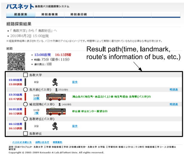
Fig. 5. Result of path planning(PC user interface)

and do. As a result, the input of the condition came to be possible without reloading of a Web page. Since PC version assumes the use from a Web browser as well as a case of mobile phone version, the server of "Bus-Net" generates HTML of PC version and sends to a PC. Fig.5 shows user interface of PC new version.