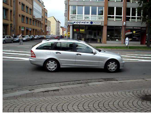
Fig.2 Original frame.

coming from different frames regions. Thus, we will consider an example to demonstrate the performance in case of a large region in a frame coming from another authenticated frame (we can repeat this case for many frames). We use RSA as a public key algorithm and SHA (Secure Hash Algorithm) as a hash function. The used block size is 8 \times 8 and two LSB plans are exploited for embedding blocks descriptions and signatures copies. We applied the proposed algorithm on the three channels of the test video which has 480 \times 640 frames.