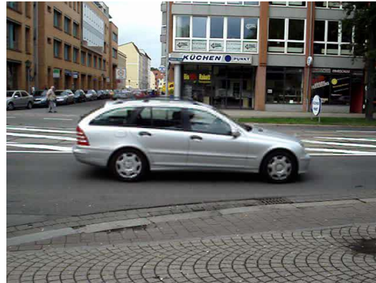
Fig. 6 Verification result reconstructing the altered blocks. Correlation coefficient=0.9939, PSNR=33.15 dB.