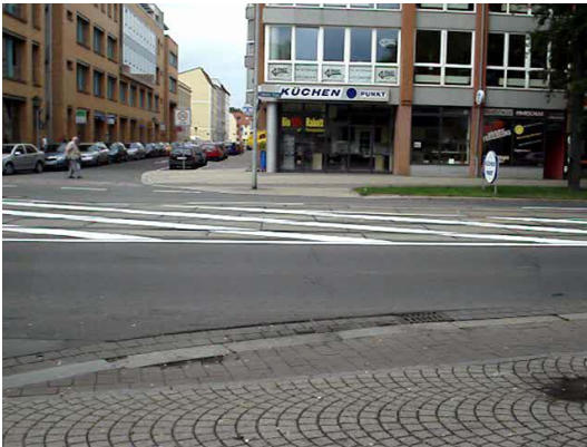
Fig. 4 Altered version of the authenticated frame.

A novel public key self-recovery video authentication technique is proposed. The proposed method is not only capable of localizing the alteration detection but also capable of recovering the missing contents with high reliability using multiple description coding. Furthermore, the proposed technique thwarts VQ attacks using a multiple links chain to securely embed the block signature copies into several arbitrary-distant blocks. Public key algorithms are utilized for guaranteeing the security and permitting anyone to test the authenticity of a given video.