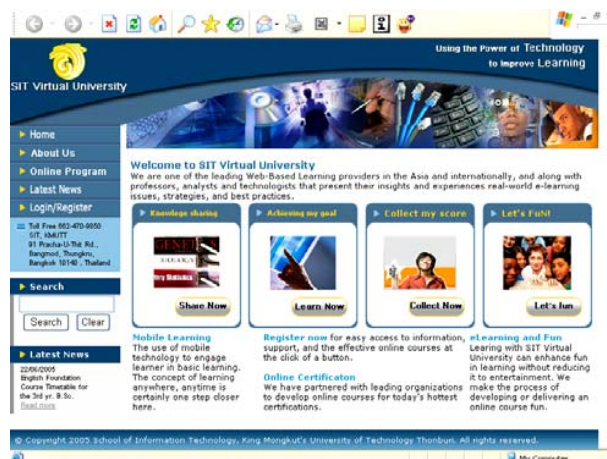
Fig. 3 An example WBL homepage

Samples of this research were composed of urban students. Most of urban students are IT-literate user, frequently use, and have easy to access WWW. Thus, it might limit the generalizability of the results. However, this study is the pilot of a larger scale study of not yet e-learning ready country. The next phase of data collection will gather from students who are novice user and do not have easy access to WWW.