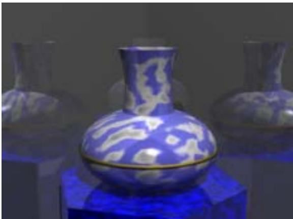
Fig. 3 'SKYVASE.POV'

The benchmark SKYVASE rendered at 1024x768 resolutions is as shown: