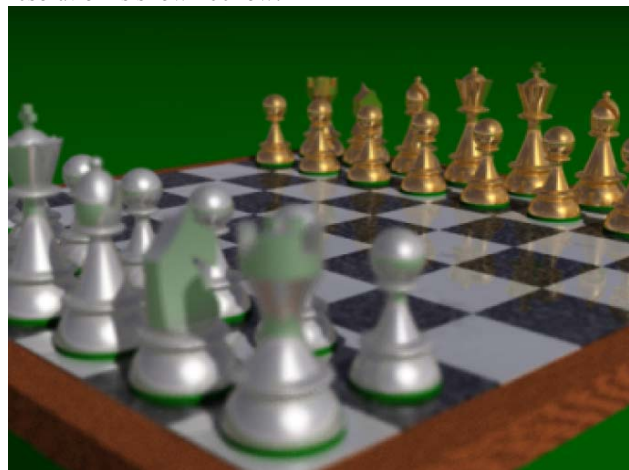
Fig. 5 'CHESS.POV'

B. This is a more complex and heavier image than the Sky Vase. The benchmark CHESS 2c rendered at 1024x768 resolution is shown below: