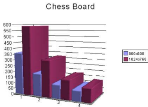
Fig. 6 Results of rendering chess.pov on a cluster with varying number of processing slave nodes