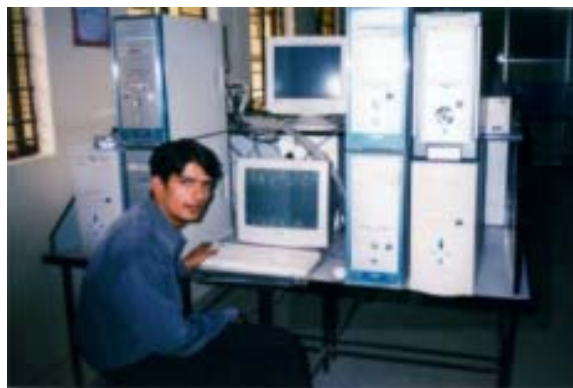
Fig. 1 The 'Linux Cluster Supercomputer'

With the power and low prices of today's PCs and the availability of 100 Mb/s Ethernet interconnect, it makes possible to combine them to build High-Performance-Computing and Parallel Computing environment. Today, there is a wide range of switches available, ranging from 8 to over 100 ports, some with one or more Gigabit modules that lets you build large systems by interconnecting such switches or by using them 5 with a Gigabit switch. Switches have become inexpensive enough, so there is not much reason to build your network by using cheap hubs or by connecting the nodes directly in a hypercube network. The local area PC cluster was made in the RVCE Hostel with the help of Department of Computer Science, RVCE for image processing and rendering. PC cluster of 7 nodes :( as shown in figure) - all of them single AMD 1.8 G Hz processors; all have 128 MB RAM, a 40 GB disk drives.