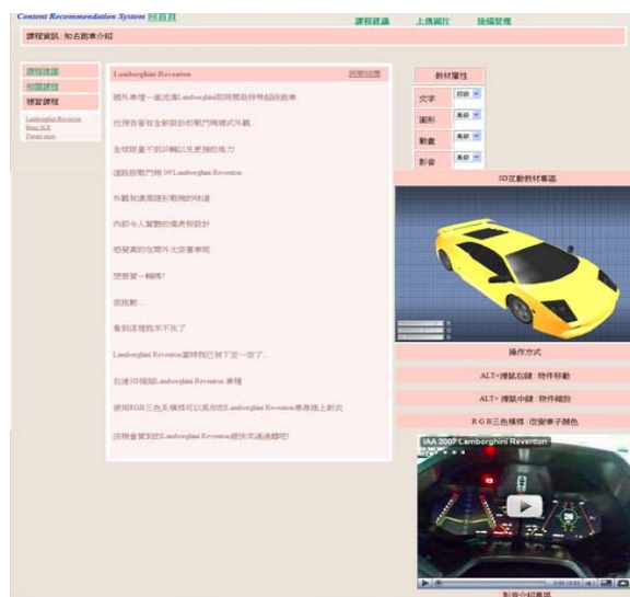
Fig. 4 The presentation of adaptive results

phase is operated online. Through the operation of the proposed system, students are more willing to learn and the problem of system overload can be reduced.