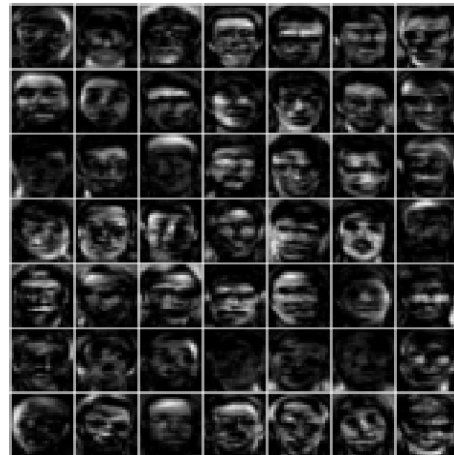
Fig. 3 The basis images of NREMFM on ORL database results.