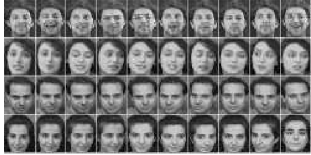
Fig. 1 Four individuals in the ORL face database.

The experiments are performed on the Cambridge ORL face database, which contains 40 distinct persons. Each person has ten different images of the size of 112x92, taken at different times. There are variations in facial expressions such as open/closed eyes, smiling/nonsmiling, and facial details such as glasses/no glasses. All the images were taken against a dark homogeneous background with the subjects in an up-right, frontal position, with tolerance for some side movements. There is also some variations in scale. We show four individuals in the ORL face images in Fig. 1.