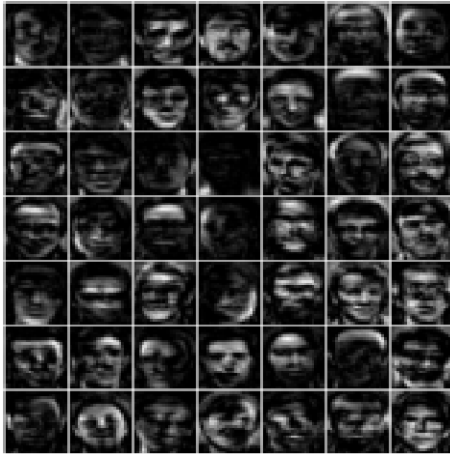
Fig. 4 The basis images of NPCA on ORL database results.

We randomly select n ( n=2, 4, 6 ) images from each person for training, while the rest of images of each individual for testing. The average accuracies of training samples ranging from 2 to 5 are recorded in Table . The recognition accuracies of PCA, NREMF, and NPCA are 34.1%, 66.7%, and 67.2%, respectively, with 2 training images. The performance for each method is improved when the number of training images increases. The recognition accuracies of PCA, NREMF, and NPCA are 92.8%, 93.5%, and 96.3%, respectively, with 6 training images. The recognition ratio of the test set reached 100% in each approach.