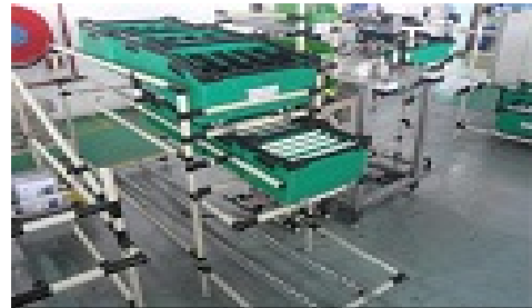
The study designed the system using MIFC. Appropriate system tools are used in the MIFC to design the most suitable Pull system for the production line. In order to have a levelled pulling effect, Heijunka post is used. Line Store is designed into the system to place the FG and the kanban chute is used to place the kanban sequence. As for the internal kanban, dual kanban system is adopted, usage of PW (Parts withdrawal)

\text{Needed Operator} = \frac{\text{W.A.C.T}}{\text{TT}} = \frac{81.41}{52.2} = 1.55 \text{ manpower}