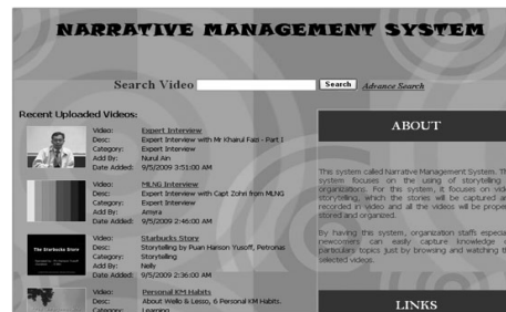
Fig. 3 NMS Main Page

Fig. 3 shows screenshot of the main page play video page.