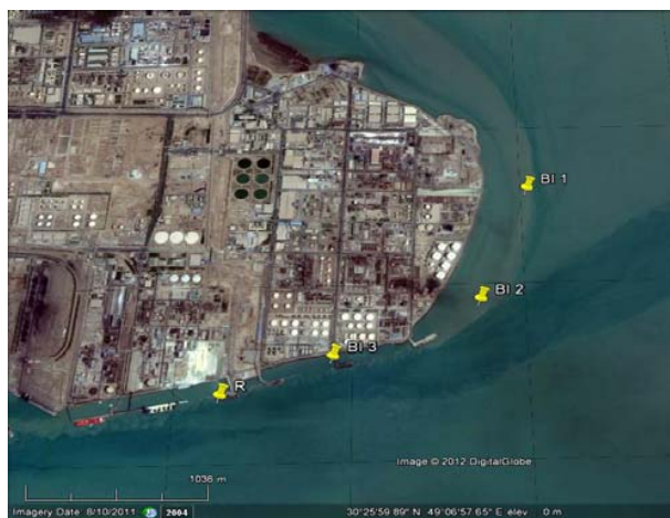
Fig. 2 Study area in Musa Bay

Petrochemical special economic zone is located in the southwestern of Iran and it is composed of 5 sites ( the area is recently been developed and Bandar-e- Imam Khomeini, Razi and Farabi Petrochemical companies has been added to this area). The Wastewater of Bandar-e- Imam Khomeini and Razi Petrochemical companies and the sediments of the coastal area of the selected petrochemical companies (in Musa Bay) were monitored from Feb 2010 to June 2010 (Fig.2 and 3).