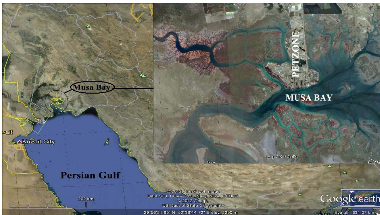
Fig. 1 Persian Gulf and Musa Bay