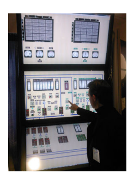
Fig. 3 Full scale simulator for French nuclear reactor pilots (France)

Doing so, something is disappearing from the training: the embodiness. "Embodiness", as introduced by Fauquet-Alekhine in 2011 [3], designates the way workers feel their engine, theirs tools, the facilities... it is a relationship with the equipment, a physical exchange with the work environment. Embodiness is incorporation into the body. This word is preferred to "Incorporation" because it contains the root "body" and preferred to "Embodiment" which is the representation or expression of something in a tangible or visible form (Oxford dictionary). The former is the incorporation inside the subject while the latter is the expression of the inside.