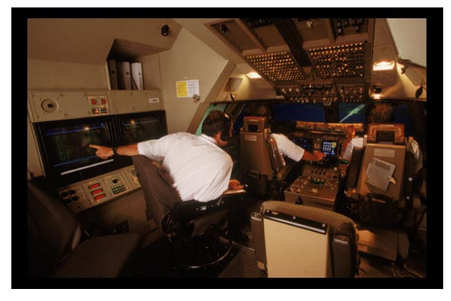
Fig. 2 Example interior of a Full Flight Simulator of Air France-KLM, Vilgenis training center (Massy-Palaiseau, France)

The aforementioned progress may change this way of training as it is already thought for nuclear reactor pilots: full