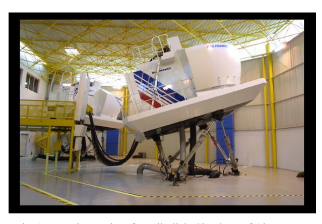
Fig. 1 Example exterior of a Full Flight Simulator of Air France-KLM, Vilgenis training center (Massy-Palaiseau, France)

illusions of acceleration, deceleration, and turning (but not looping!). These high fidelity simulators are expected to give the trainees a high level of contextualization of the simulated situation, it means a simulated situation as much close to the real operating situation as possible so that the trainees may feel the real operational context on simulator. When qualified on simulators, the pilots must take qualification tests on real flights, and when this is achieved, they co-pilot for several years with more experienced pilots, the captains, before becoming themselves captains.