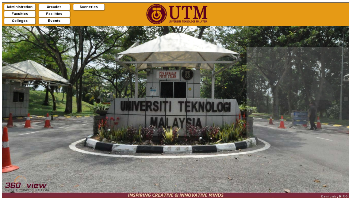
Fig. 6 Virtual Tour