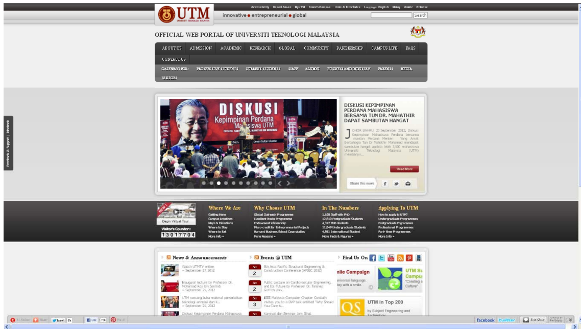
Fig. 4 The First Frame of Universiti Teknologi Malaysia's Website