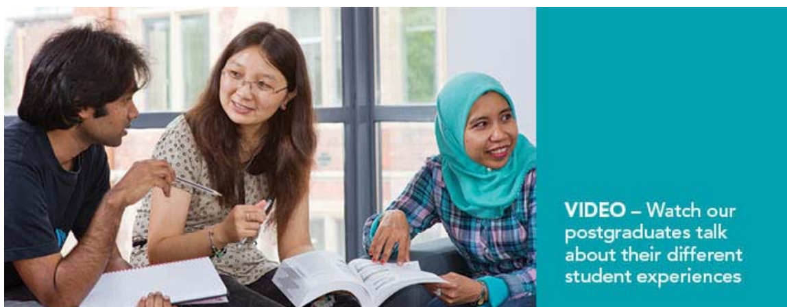
Fig. 2 A Photo of International Postgraduate Students