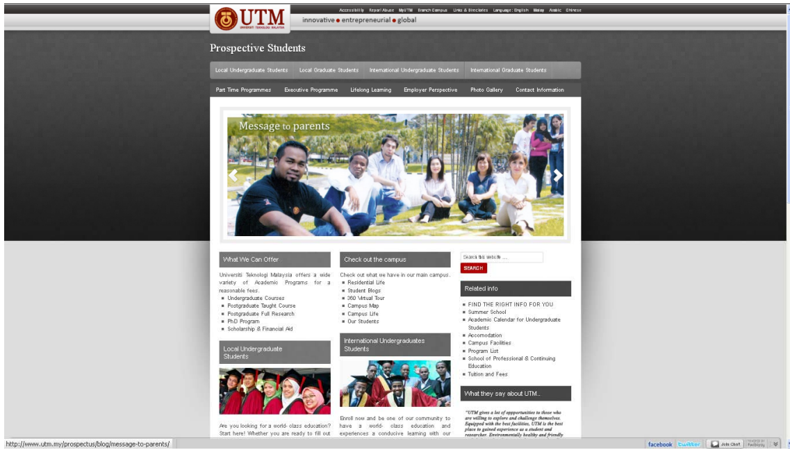
Fig. 5 Cultural Integration