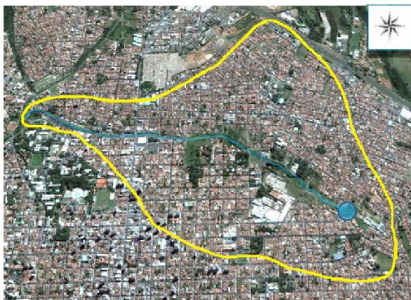
Fig. 2 Sub-basin of the Tijuco Preto stream (No scale defined)

The spring of the Tijuco Preto stream is at an altitude of 846 meters, under the coordinates 203175.16 E/7563233.03 S (UTM SAD 69, Zone 23S). From the source to the mouth, the stream has a length of approximately 2.900 meters and flows into the Ribeirão do Monjolinho, the main water body of the city of São Carlos (Fig. 2).