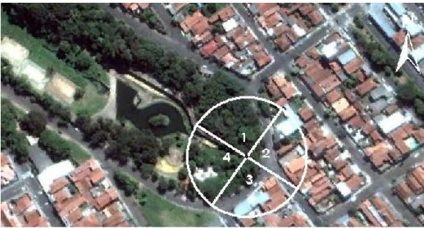
Fig. 5 Quadrants used for the analysis of the PPA in the Medeiros spring (No scale defined)

Fig. 5 indicates the passage selected for analysis, corresponding to the PPA of the source, and the division of quadrants that were used.