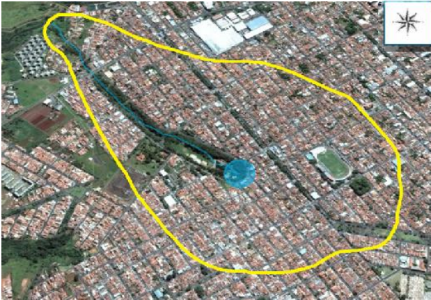
Fig. 4 Sub-basin of the Medeiros stream (No scale defined)

The PPA of the Medeiros stream has a higher homogeneity in terms of tree cover and less human interventions in the river channel, compared to the PPA of the Tijuco Preto stream.