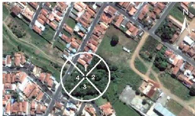
Fig. 3 Quadrants used for the analysis of the PPA of the spring of the Tijuco Preto stream (No scale defined)

Fig. 3 indicates the stretch selected for analysis, corresponding to the PPA of the source, and the division of quadrants that were used.