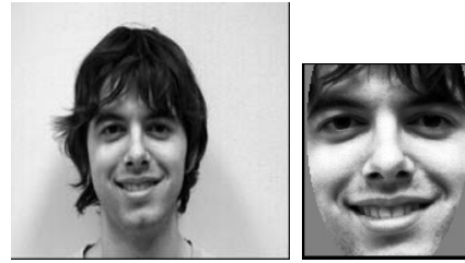
Fig. 2 Face extraction in the visible spectrum.

For face learning and recognition, we extract face regions for further processing. In the visible, NIR and SWIR spectrums, face images are extracted using the alignment technique proposed in [11] (Fig. 2).