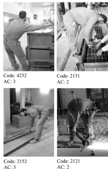
Fig. 2 Some of the postures are shown with Code and AC