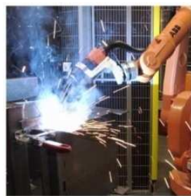
(b) welding in operations