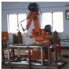
(a) Welding machine

Bead-on-plate welding trials were conducted using an ABB MIG Robot 500 with IRC 5 controller welding system is presented in Fig.1(a and b).