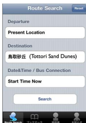
Fig. 4. Top page of the interface