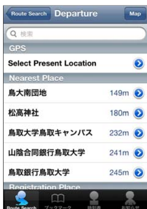
Fig. 5. Set to landmark

Evaluated number of user action is the total sums of respectively coefficient of evaluation multiply count of actions. Coefficients of evaluation are value of table I. A coefficient of switched screen is heavy cost. However, a coefficient of scrolled screen is light cost.