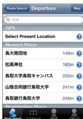
Fig. 5. Set to landmark

Evaluated number of user action is the total sums of respectively coefficient of evaluation multiply count of actions. Coefficients of evaluation are value of table I. A coefficient of switched screen is heavy cost. However, a coefficient of scrolled screen is light cost.