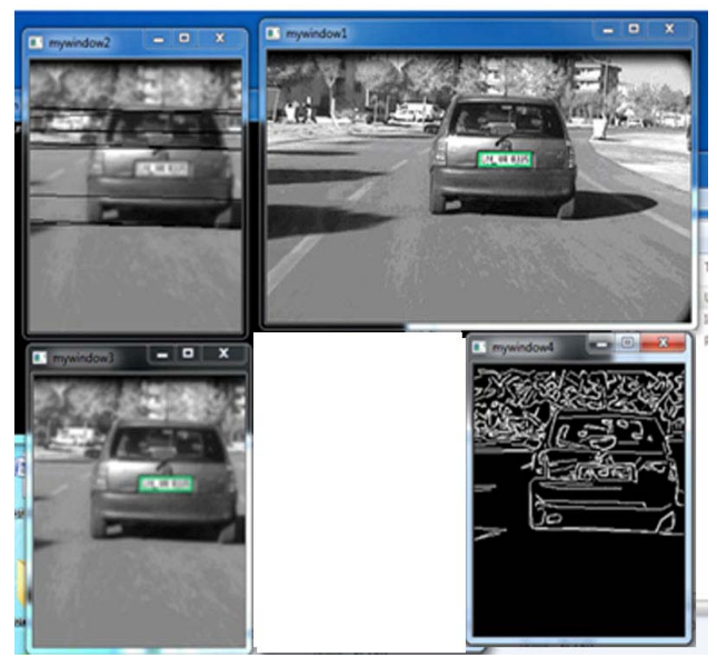
Fig. 1 Application of filter

License plates height measured in cm and then this sizes equivalent in pixels measured. After the comparison of the real pixel value with the values in the data's, distance between the camera and license plate has calculated. While measuring speed differences, same procedures in the measuring distance have applied. Captured frames values subtracted with the former values. This value divided to the capturing times between frames and speed differences have calculated [3, 7].