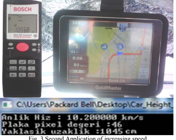
Fig. 3 Second Application of increasing speed