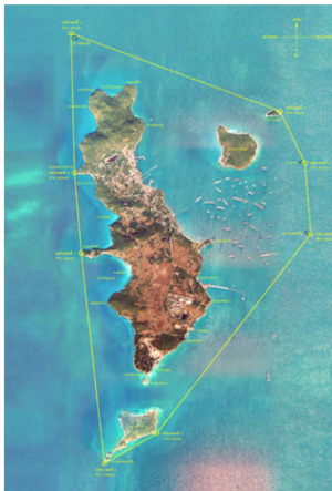
Fig. 1 Sichang Island and Harbor boundary