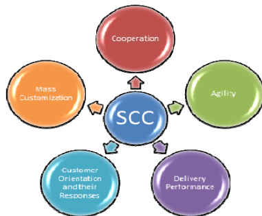
Fig. 3 SCC model based on the strategies

Considering the importance of these strategies, a conceptual model of supply chain competitiveness has been thought of and represented in Fig. 3.