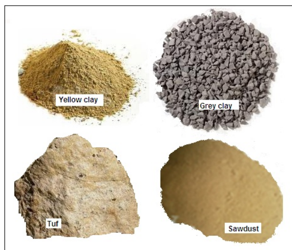
Fig. 1 Raw material

Sawdust and clay used in this study is categorized as Eucalyptus and Pine Alep-Mixed in terms of their particle sizes. Fig.1 shows the raw materials used in the fabrication of bricks samples.