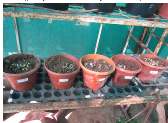
Fig. 4 H 2 SO 4 treated Vigna radiata plants on 3 rd day