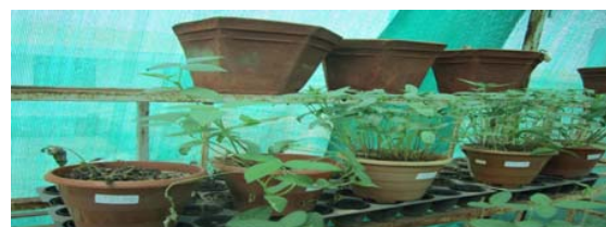
Fig. 5 Vigna radiata showed more growth in 0.1% HNO 3 treated plants