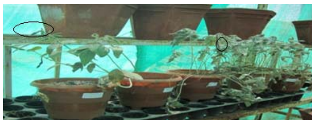
Fig. 8 Vigna radiata 0.1% \text{HNO}_3 , 0.01% \text{HNO}_3 treated plants showed seed

On 42 th day, In Vigna radiata 0.1% \text{HNO}_3 , 0.01% \text{HNO}_3 and 0.01% \text{H}_2\text{SO}_4 treated plants showed seeds on plants.