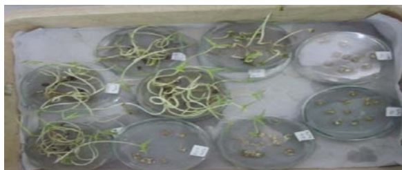
Fig. 3 Germination of Vigna radiata seeds treated with HNO 3 & H 2 SO 4 concentrations on 7 th day. On 10 th day fungal growth was observed in 1% and 0.1% H 2 SO 4 concentrations when all plants were dead