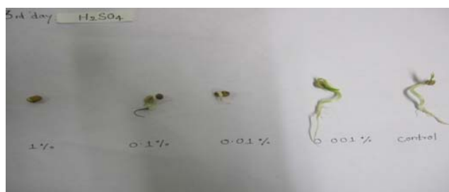
Fig. 2 Germination of Vigna radiata seeds treated with H 2 SO 4 concentrations