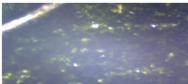
Fig. 12 Leaf sections of Vigna radiata control plant

Tables I and II showed the variation of pH to 0.1 to 0.001% \text{HNO}_3 and \text{H}_2\text{SO}_4 acid treated soil samples. The lowest rain pH values measured by [14] and [9] observed the acidity of the precipitation in Shanghai was considerably high with the annual mean pH value of 4.49 and the frequency of acid rain was 71%. The lowest pH of the rain event reached 2.95.