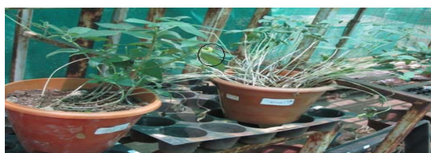
Fig. 7 Flowers were observed on 0.1% \text{HNO}_3 treated Vigna radiata plants

Vigna radiata showed flower in 0.1% \text{HNO}_3 , 0.01% \text{HNO}_3 and 0.01% \text{H}_2\text{SO}_4 treated plants and no flowers were observed on control plants on 34 th day.