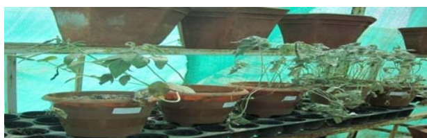
Fig. 9 Dead plants of Vigna radiata