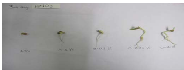
Fig. 1 Germination of Vigna radiata seeds treated with HNO 3 concentrations