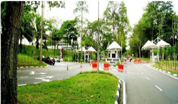
Fig. 2 Road connecting UTM and Taman Universiti

The vehicle route is sub divided into three types namely as main road, secondary road and service road. The main road in the campus is the road connecting UTM with Skudai Pontian Highway and Taman University. This road is the main access to the university campus.