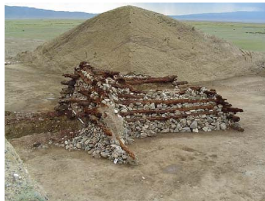
Fig. 1 The tomb of logs

Structurally, the mound Baygetobe consists of three levels. The first level is a wooden tomb, built at the level of the surface of the earth. The walls of the tomb comprised two-row checkered frame, where the open space between the logs was filled with stones. The eastern side of the tomb was in the form of a truncated pyramid. Floor area of the tomb was about 20 m 2 . The tomb was blocked by a tight-fitting log rolling close to one another. The height of the tomb is 4.1 m (Fig. 1).