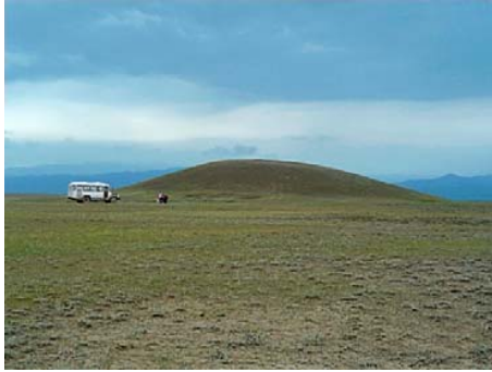
Fig. 2 Baygetobe barrow. General view

Earthen covering of mound, in its own turn, consisted of four construction stages. Between some of the tiers minor superficial layer of the earth can be traced, which indicates that small breaks took place in the construction of individual stratigraphic levels earthen mound.