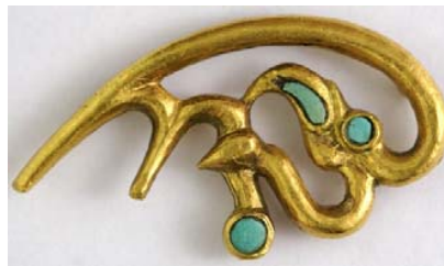
Fig. 8 The metal plate called "golden eagle"

Comparing all known images of eagles, it is possible to make the following conclusion. Eagle from the mound number 1 of burial Shilikti-3 is the most advanced, the earliest of all known images of the eagle sewn on plaques Saka-Scythian cultural and ethnic community.