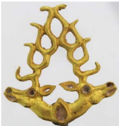
Fig. 7 The metal plate called "deer"

The decoration in the form of an eagle is made of pure solid gold. It indicates a bird of prey curled his head on the right side. Its beak is strongly bent, but not spiral as in the pictures of griffins. The upper mandible is outlined. The eyes are large and round. The upper part of the body and wings are highly stylized and composed from convex stem like band in the form of an open semi-circle, tapering towards the end. The lower part of the body, legs, tail is also highly stylized. They are also composed of wavy curved convex stripes running down from the bird's neck to the tail. Eagle claw is also stylized and ends with a ring. During a careful inspection, it is possible to see a snake, clutching an eagle's paw. The tail of the snake at the same time forms the lower torso of the bird. This story reflects world view of Sakas, which displays the struggle between two principles, the earthly and the heavenly, the struggle of representatives of two elements - earth and sky (Fig. 8). S.S. Chernikov found nine instances of plaques in the form of eagles in the burial mound number 5 of Shilikti.