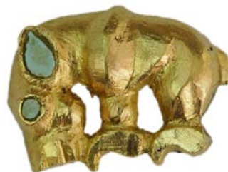
Fig. 9 The metal plate in the form of wolf-cub or bear-cub

The decoration in the form of a wolf (bear) is of great importance (Fig. 9). In this decoration an image of predatory animal's baby is shown. The head and nose just reminds new born wolf cub. However, the body, feet, tail resemble a bear cub. The images of creatures that combine the features of a wolf and bear were encountered in the Scythian-Saka fine arts before. On the back the ornament has two buckles.