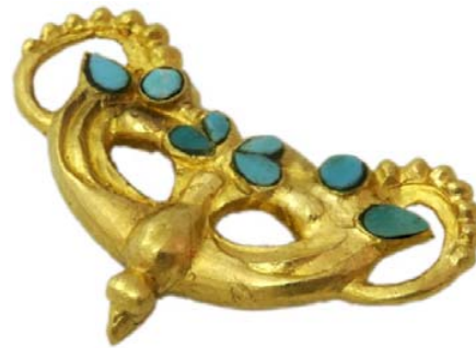
Fig. 6 The metal plate in the form of panther mask

By its composition significant-button clasp in the form of animals of the panther mask is very complex and sacred ornament (Fig. 6). This ornament was conventionally called Bars by us. If we look closer the decoration from different angles, then it is possible to discern three different compositions. From a distance, the decoration resembles the face of the beast feline. If to look more closely, the head and horns of two mountain goats, illustrated face to face are clearly seen on the clasp. Eyes, mouth and ears of these animals are decorated with turquoise. The third image in this decoration can be seen in a side glance: profile of the decoration resembles a soaring giant bird.