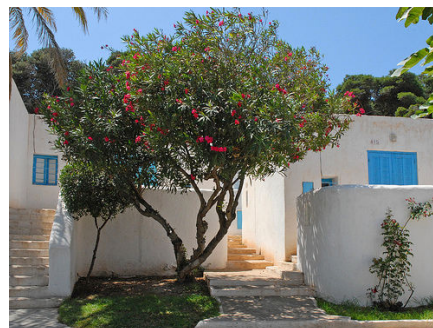
Fig. 3 View of a bungalow

A view of a bungalow is given on Fig. 3.