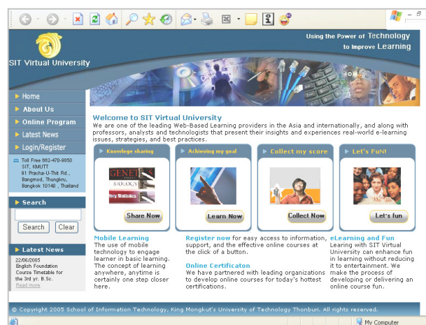
Fig. 3 An example WBL homepage

Samples of this research were composed of urban learners. Most of urban learners are IT-literate user, frequently use, and have easy to access WWW. Thus, it might limit the generalizability of the results. However, this study is the pilot of a larger scale study of not yet e-learning ready country. The next phase of data collection will gather from learners who are novice user and do not have easy access to WWW.