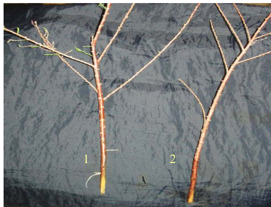
Fig. 3 Effect of a biostimulator on rooting of shanks Tamarix gracilis . 1 - an experimental plant processed by a solution of a biostimulator (50 ng/ml). 2 - the control plants. Time of an exposition – 1 month

We investigated applicability of our biostimulator as a hormone for acceleration of vegetative reproduction of perennial plants. For this purpose we have taken shanks of desert plant Tamarix gracilis have left on 12h soaked in a solution of a biostimulator of concentration 50 ng/ml. After that shanks have taken out and have lowered them in drink water. Water was changed each 4-5 days and experiment was carried out within 1 month and observed formation of roots and leaves at shanks. Results of experiments are given in Fig. 3.