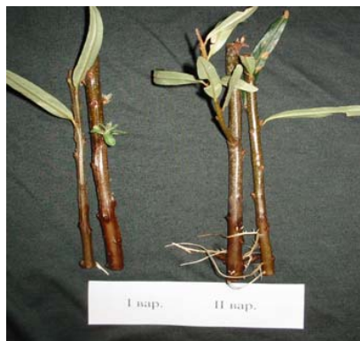
1 2 a

Experiments on rooting were carried out with Tamarix gracilis too. Results are presented in Figs. 4 and 5. It is necessary to note that the biostimulator causes formation of roots and also the formation of leaves. The given fact is distinctive feature of our new biostimulator. All other phytohormones have polarity of action. For example, auxine stimulates formation of only lateral roots and stops growth of leaves. Cytokinin stimulates growth of leaves, and growth of roots is not observed.