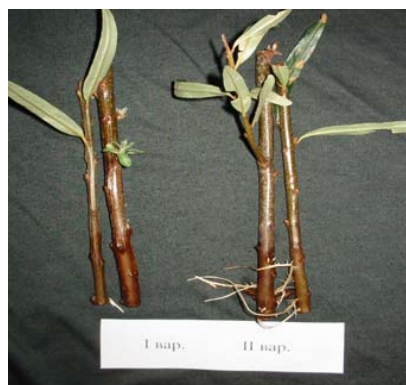
1 2 a

Experiments on rooting were carried out with Tamarix gracilis too. Results are presented in Figs. 4 and 5. It is necessary to note that the biostimulator causes formation of roots and also the formation of leaves. The given fact is distinctive feature of our new biostimulator. All other phytohormones have polarity of action. For example, auxine stimulates formation of only lateral roots and stops growth of leaves. Cytokinin stimulates growth of leaves, and growth of roots is not observed.