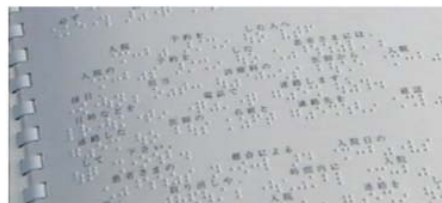
Fig. 2 Hospital brochures in braille and the example of printed page