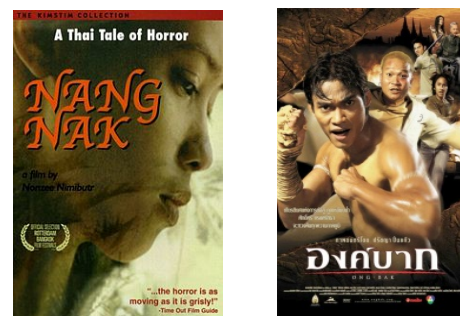
Fig. 1 Movies with Thai culture