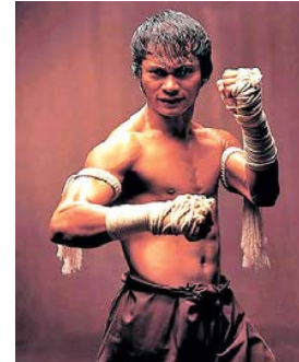
Fig. 4 Tony Jaa, a leading actor in Ong-Bak (2003)

From key informants' viewpoints, Thai directors would not become famous in the eyes of the audience but would be known in film festivals such as in Cannes, France. International audiences remembered the movie and the outstanding star instead. Stars or actors in some countries as England, Korea, Hong Kong, and Hollywood could be sold with the movies but not really in Thai movies.