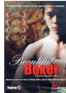
Fig. 5 Asanee Suwan, a professional boxer as Nong Thoom in Beautiful Boxer (2003)