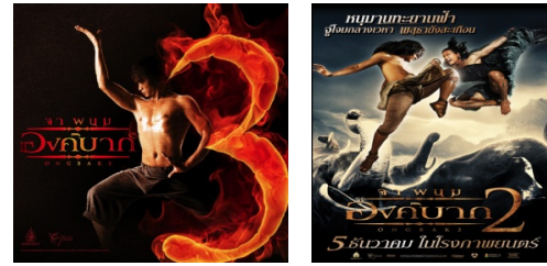
Fig. 2 Ong-Bak , an action outstanding Thai film in 2003